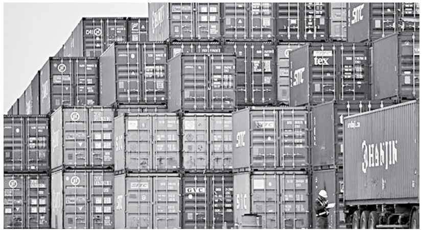
A labourer works in a container area at a port in Tokyo, Japan.

"The Chinese economy will resume recovery once a renewed rise in infections fades, and the vaccine rollouts and huge stimulus will give a boost to the US economy, all of which should help accelerate Japan's exports and broader economy in April-June."