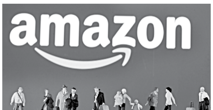
Small toy figures are seen in front of displayed Amazon logo in this illustration.

What else is there to do if one cannot go out except slump on the sofa to watch television and play video games while munching on your latest dine-in delight?With the cinema out of bounds, the home-based version took off big time, with Netflix building an audience of 200 million on an offer of high-class films and series typified by "The Crown," the story of Britain's Queen Elizabeth II. Disney, not to be left behind, launched its Disney+ service late 2019 and had