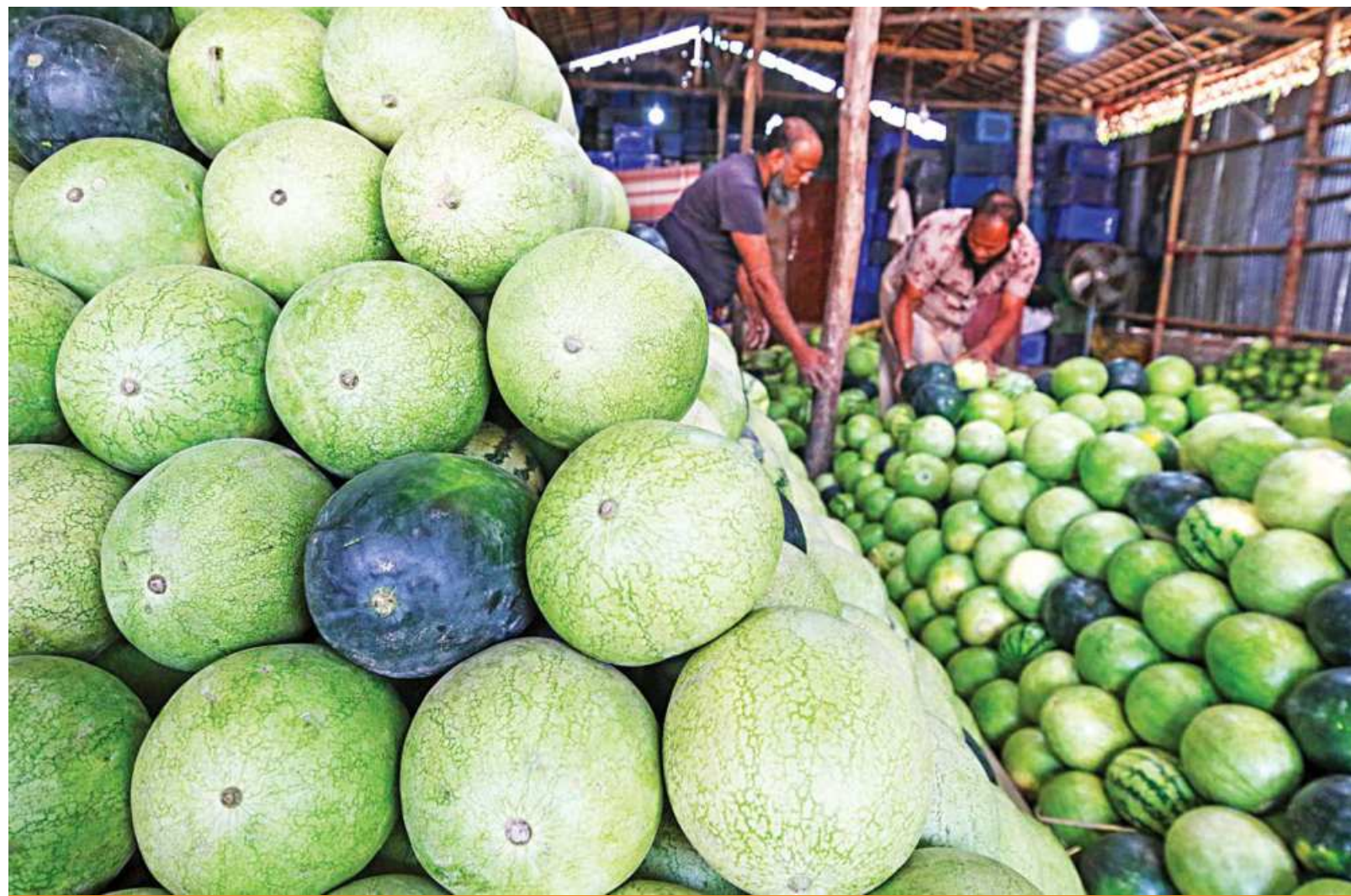
Watermelons are piled up at a shop in Dobash Math of Kotwali in Chattogram yesterday. Favourable weather allowed farmers to produce a good quantity of the fruit this season. Depending on the size, each of them were being sold between Tk 15 and Tk 60.

"Despite the economic impact of Covid-19 2020 was the sixth consecutive year of increased defense spending across European allies and Canada with an increase in real terms of 3.9 percent," Stoltenberg told a press conference to mark the launch of Nato's annual report.