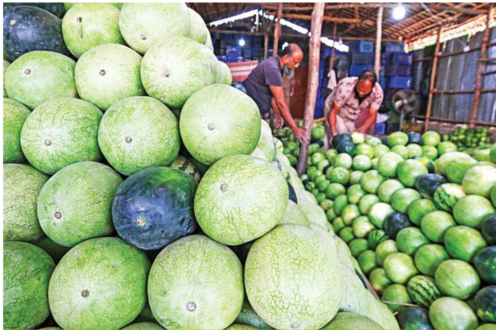
Watermelons are piled up at a shop in Dobash Math of Kotwali in Chattogram yesterday. Favourable weather allowed farmers to produce a good quantity of the fruit this season. Depending on the size, each of them were being sold between Tk 15 and Tk 60.