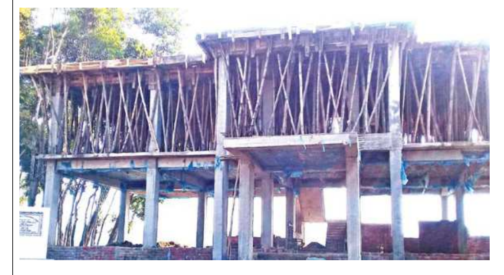
The under-construction building of Barni Union Health and Family Welfare Centre in Moulvibazar's Barlekha upazila.

The matter will be reported to the higher authorities, said the UNO.