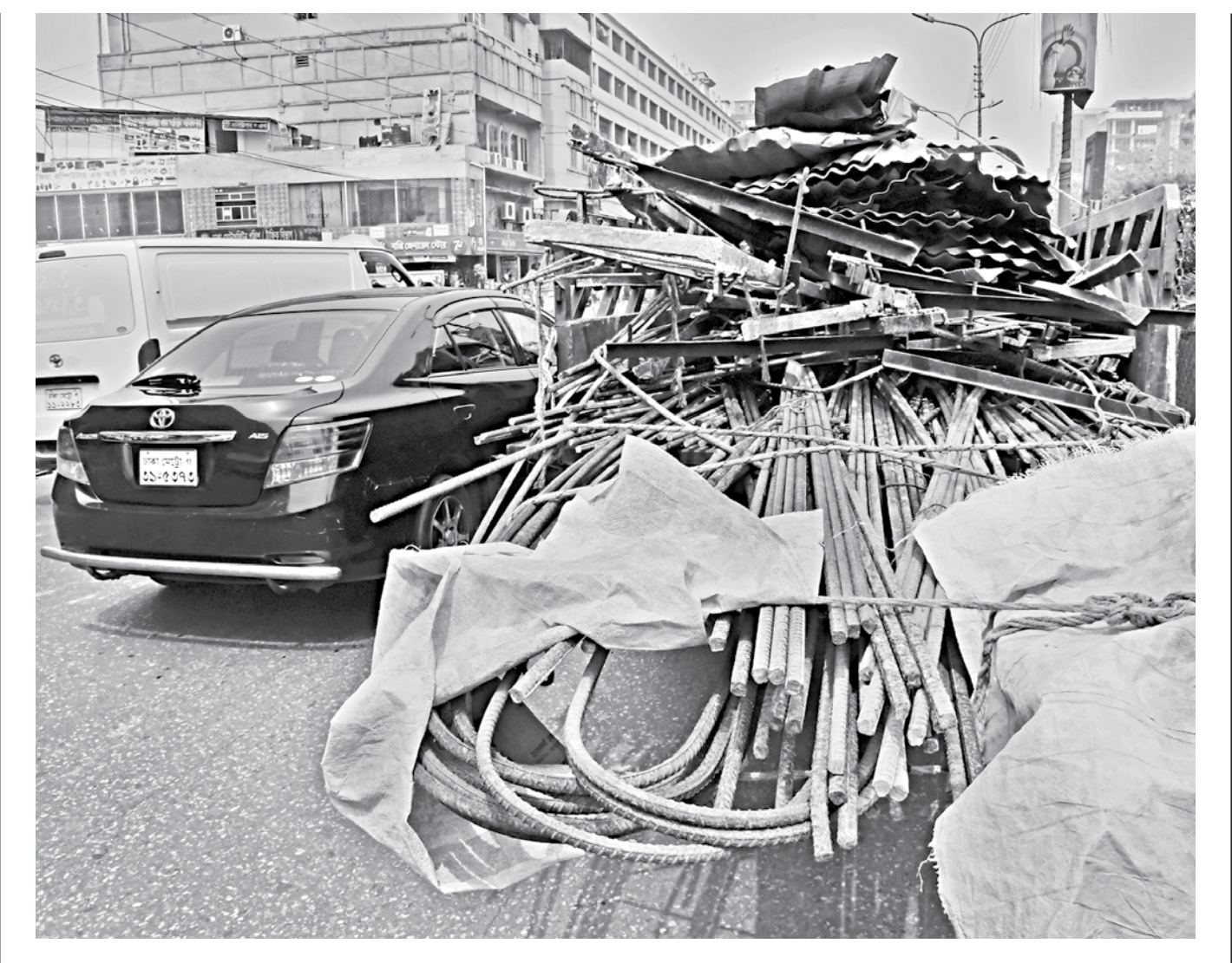
Vehicles that carry overflowing heavy load don't just take up extra space on the road, they're also dangerous for pedestrians and vehicles that follow them. This photo was taken yesterday from the apital's Airport Road, near Kakoli.

The IO informed HC that he applied for the postmortem report thrice, but to no avail, said Sarwar.