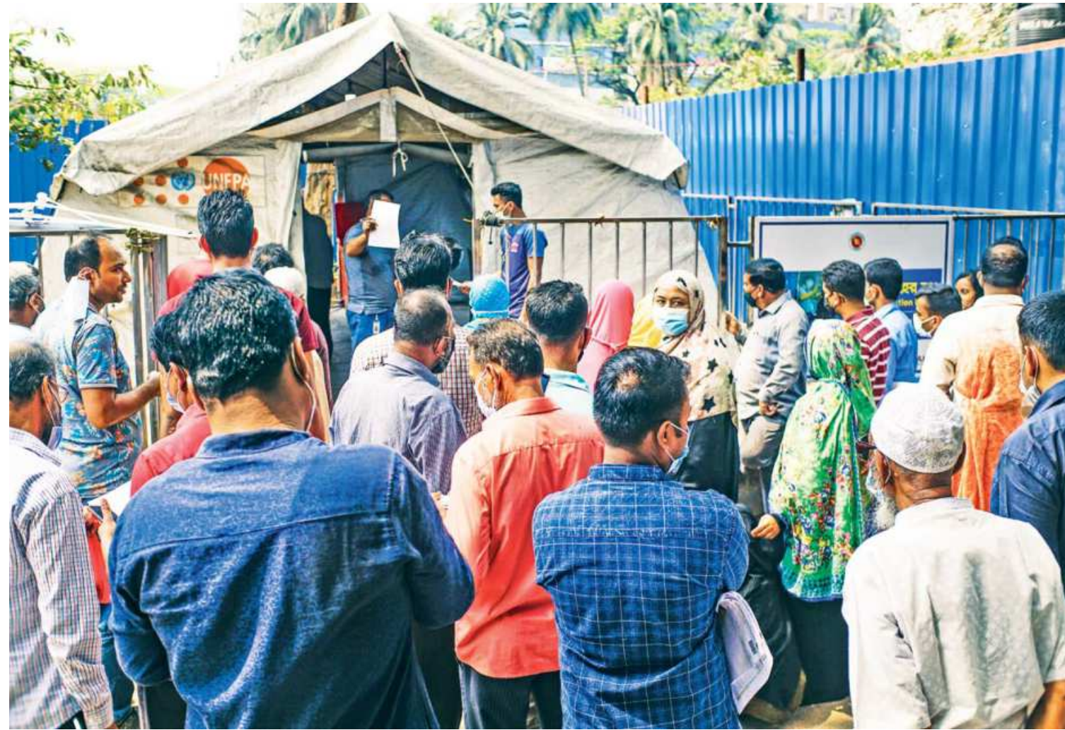
People waiting to get tested for coronavirus in front of a tent on the premises of Shaheed Suhrawardy Medical College and Hospital yesterday. Testing facilities are again seeing queues of people as the number of new cases has recently been on the rise.