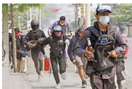
Mandalay, according to a local doctor and an AFP reporter.

There was a further death in the city of Monywa, state media said, while two men in their 20s were killed on the spot in