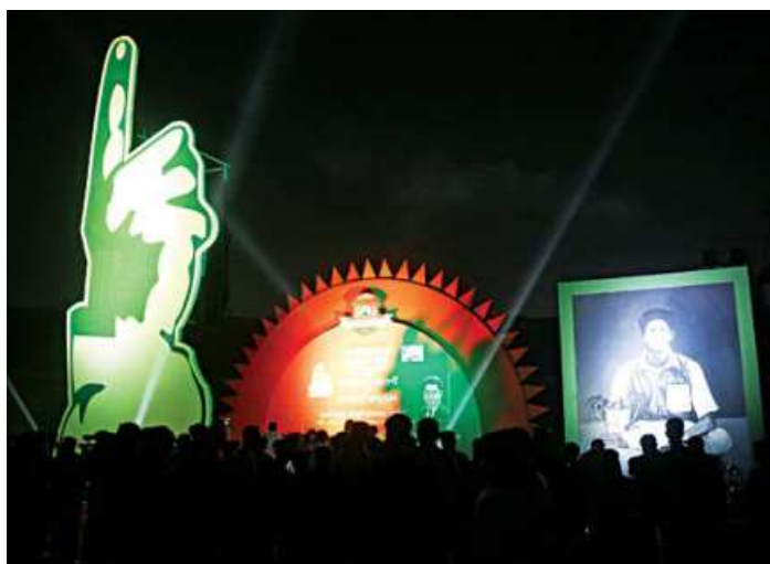
Measured at 50 feet high, the largest Index finger of the Father of the Nation Bangabandhu Sheikh Mujibur Rahman was exhibited on the final day of the DSCC (Dhaka South City Corporation) -introduced tournament titled 'Inter-Ward Sports Competition 2021' at the Bangabandhu National Stadium yesterday. (R) Ward-4 cricketers celebrate during the prize-giving ceremony as they beat Ward-11 by two runs earlier in the day.

"He is a fantastic character. He has had a massive influence on world football over the past years. He's passionate about things beyond football too and is an incredible human being."