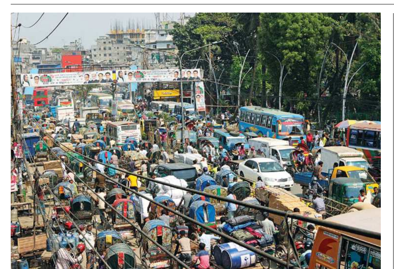
The traffic at Old Dhaka's Babu Bazar bridge remains congested throughout the working day. Vehicles passing through here often take sharp turns towards Mitford Hospital. Locals say it's these vehicles that are to blame for the incessant traffic in the area. This photo was taken yesterday.

The project was supposed to be completed in between December 2012 and 2016, but has SEE PAGE 4 COL 3