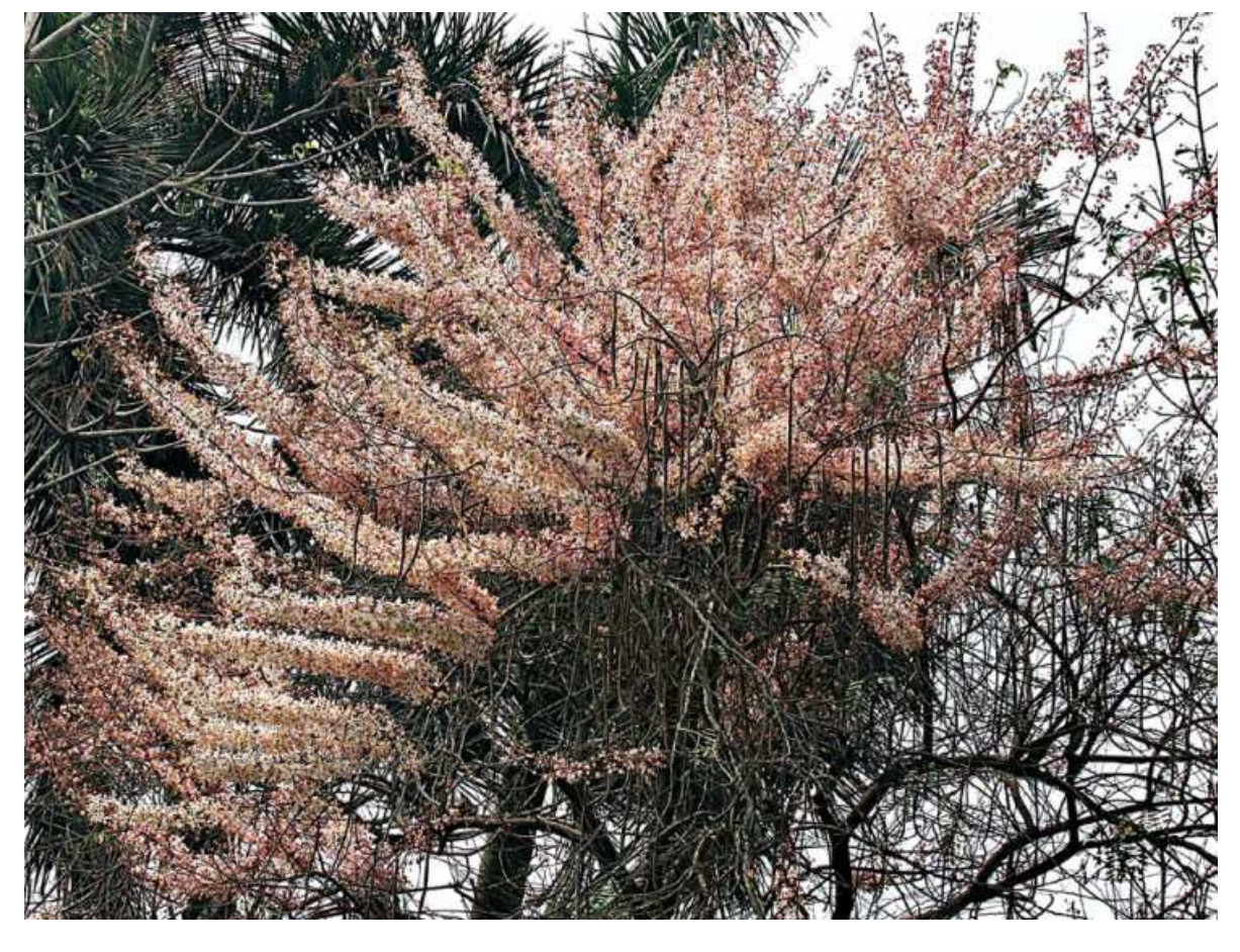
Bangladesh's soil is not known to be good for Cherry trees. Maybe that's why the few that grow during spring stand out so much. As this one breathes in DU's Department of Physics, with cherry flowers blossoming from every branch, it brings a sense of serenity to the pedestrians who pass by. This photo was taken yesterday.

She also said the government has framed BIDF to meet the country's import costs of six months considering frequent natural calamities, and