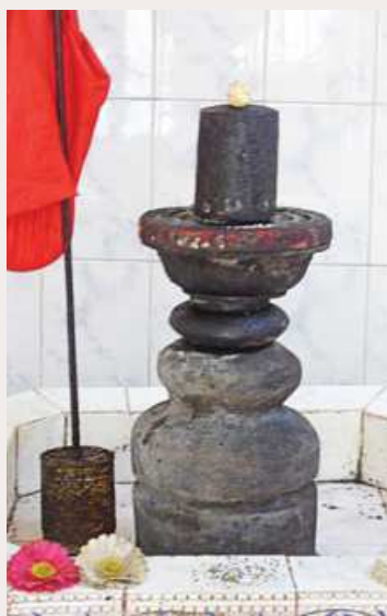
These are among the four academically unrecorded antiquities kept at a Hindu monastery in Sylhet city. The photos were taken recently.