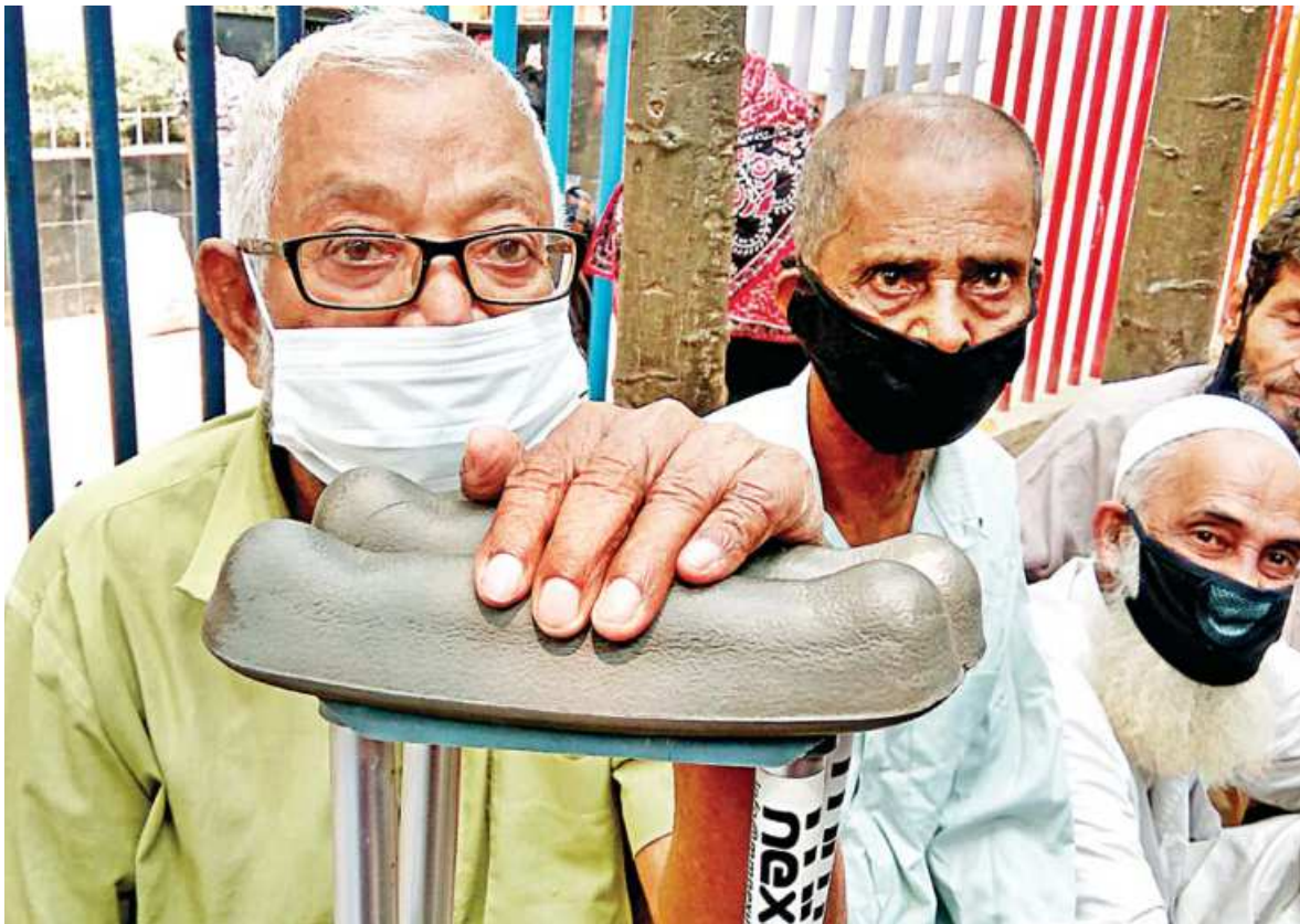
Sitting in front of the ward-35 councillor's office in the capital's Moghbazar area, an elderly man along with others around his age wait to register themselves for old-age allowances. The initiative has been taken by the social welfare ministry in cooperation with the Dhaka North City Corporation. The photo was taken yesterday.