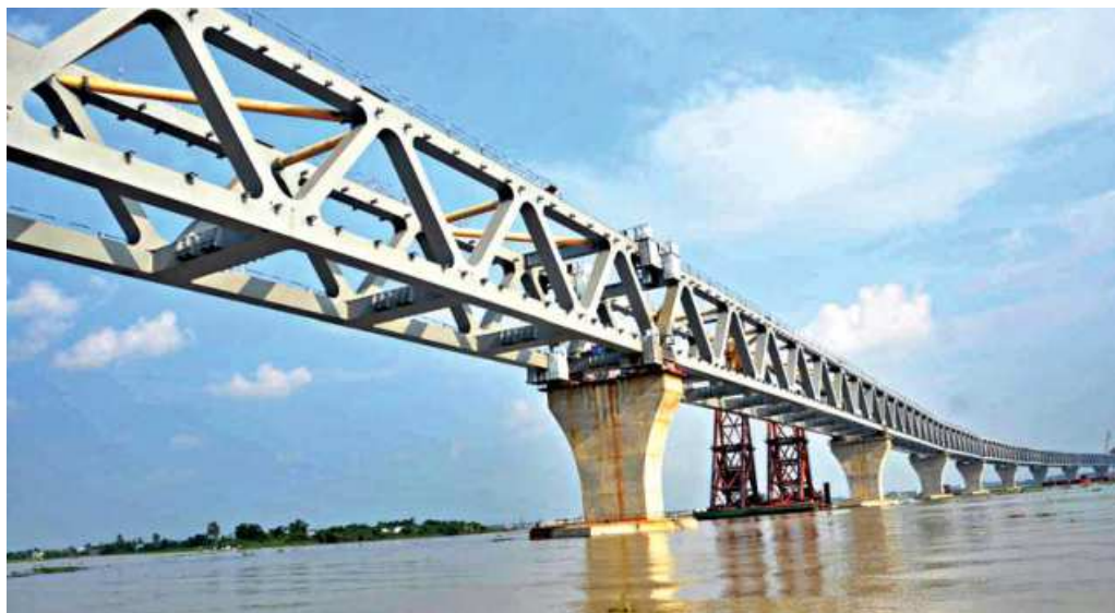
After several deadline extensions and cost escalations, the government now looks to complete the Padma bridge project by June 2022.

After several deadline extensions and cost escalations, the Padma bridge project, which the