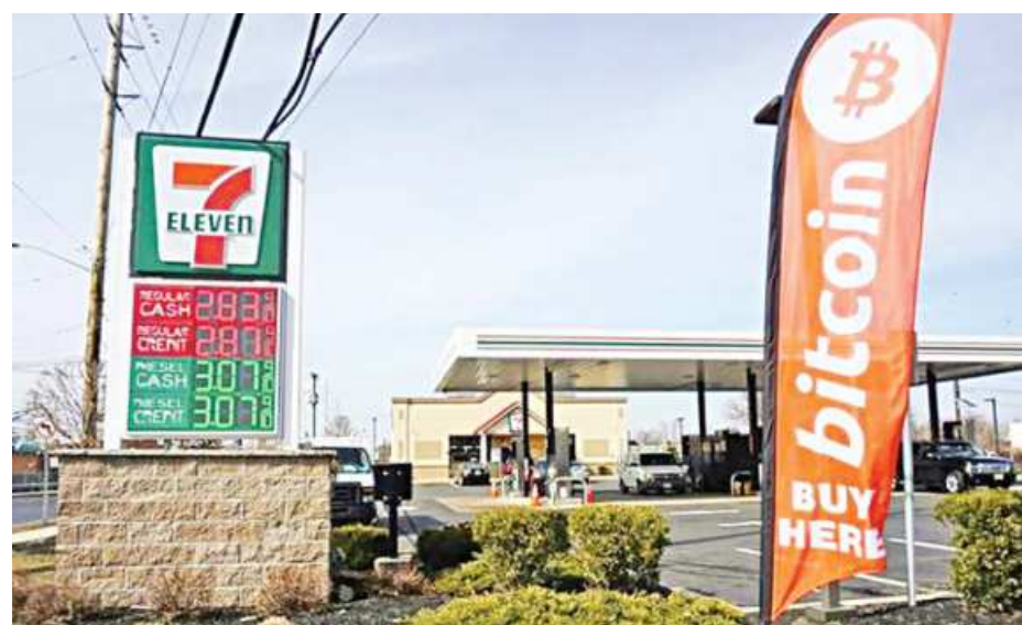
Bitcoin ATMs are rapidly gaining popularity in the US, where a frenzy of crypto trading has shot bitcoin prices above $58,000.

"The growth of the ATM market - it is not even a gentle increase, it is almost a 45 per cent increase," Clegg said. "The growth is quite astonishing." Government agencies have raised red flags about some machines because of their cost and the potential for illicit activity.