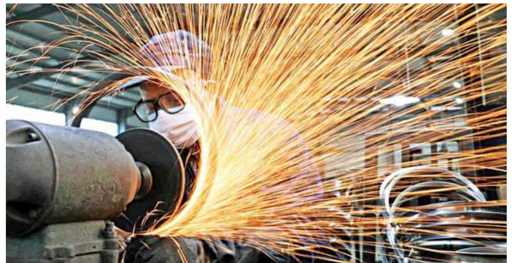
China's economic recovery from the ongoing coronavirus pandemic has been fueled by increased industrial output amid growing activity in the retail sector.

A rebound in foreign demand drove export growth in February to a record pace, while factory gate prices posted the biggest expansion since November 2018.