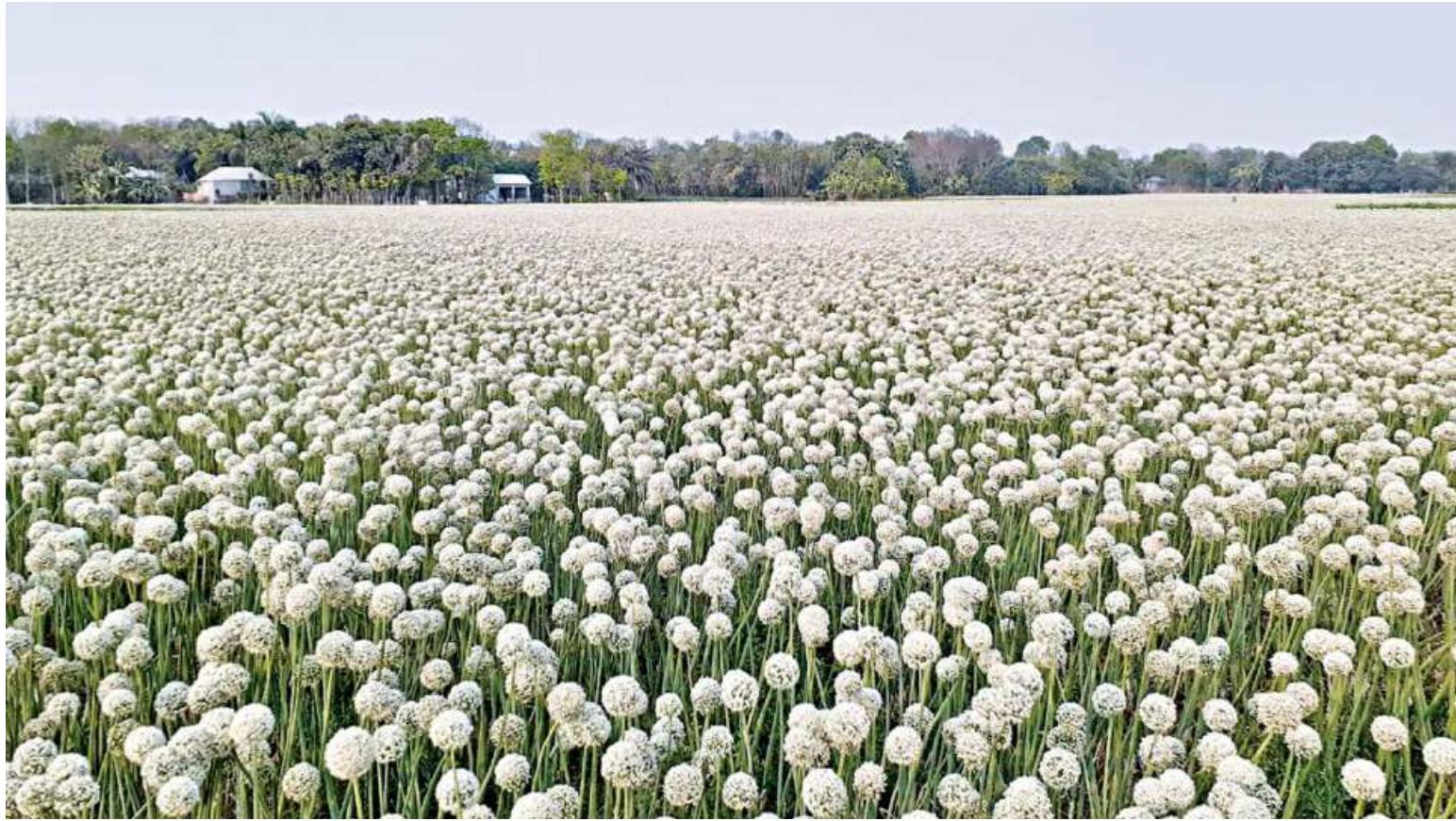
Onion seeds are in full bloom in a vast field in Faridpur, one of the largest seeds and onion growing regions in the country. The seed harvesting begins next month.