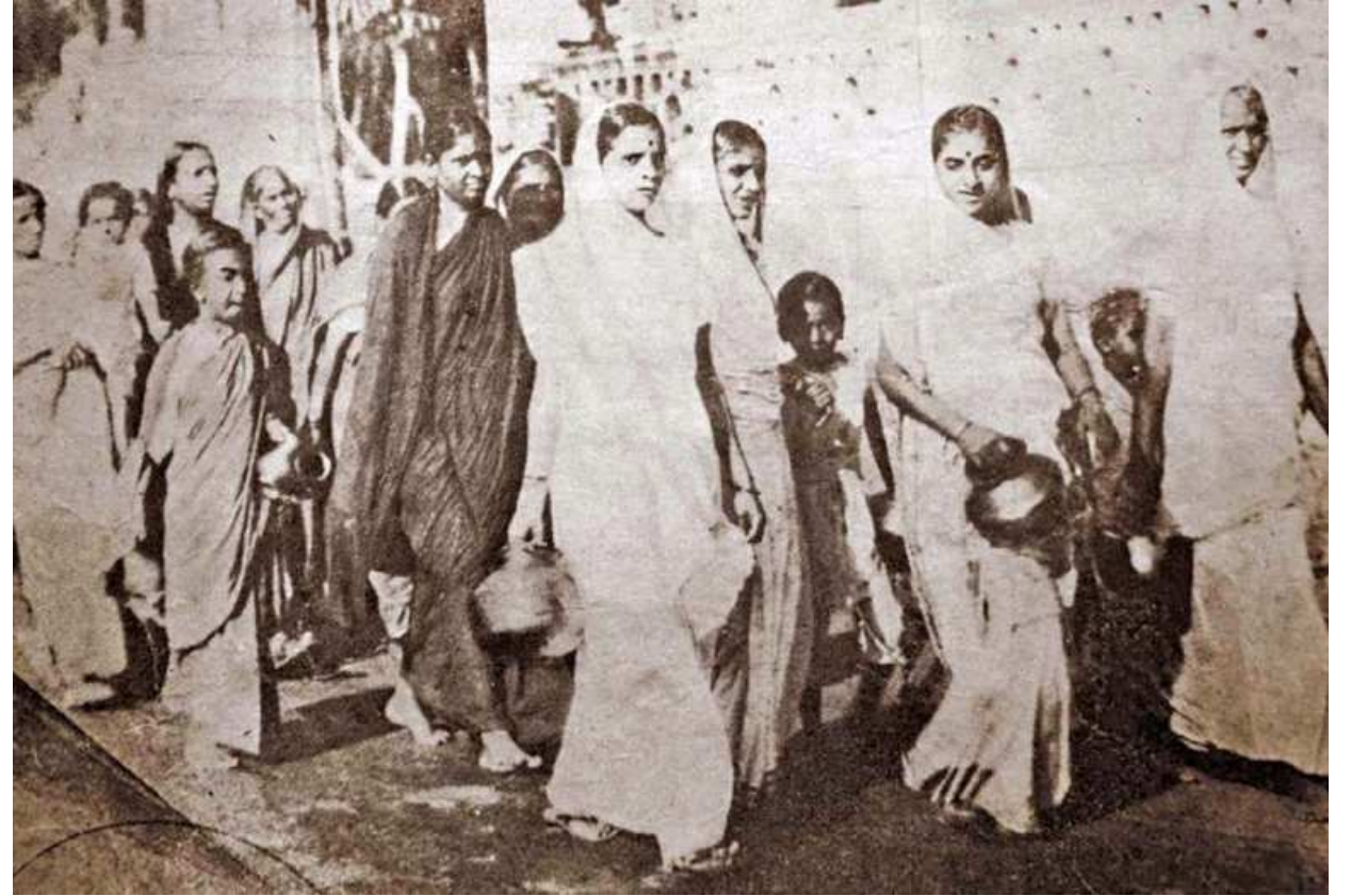
Women played key role during the movement by organising salt making at multiple locations.