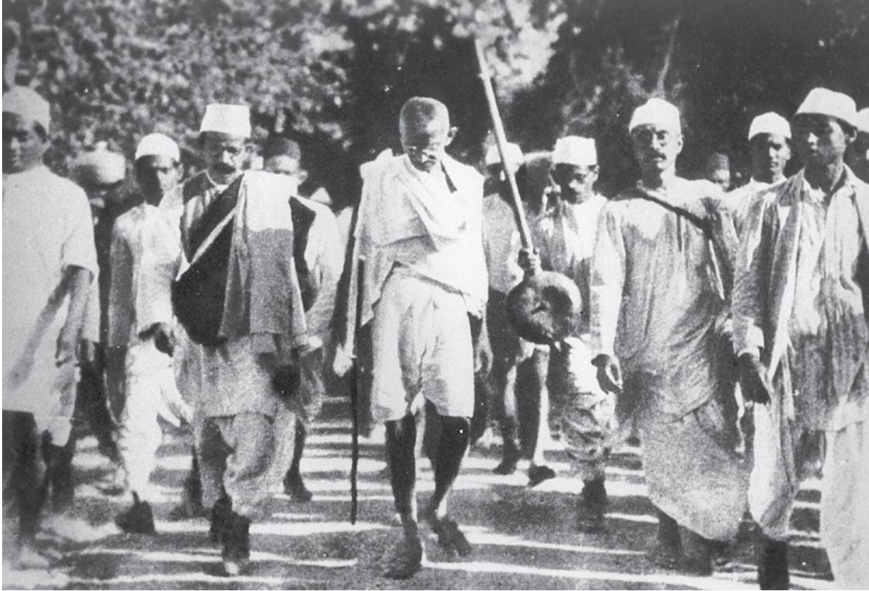
Gandhi leading his followers on the famous salt march to break the British Salt Laws, March, 1930.