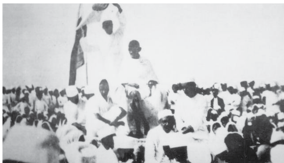
Gandhi at a public rally during the Salt Satyagraha.