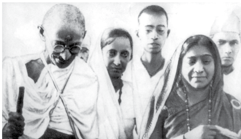
Mahatma Gandhi and Sarojini Naidu during the March.