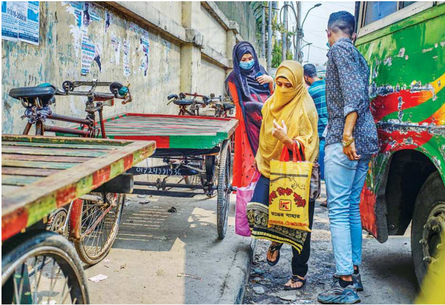
Rickshaw-vans block a footpath adjacent to Phulbaria road behind the office of Dhaka South City Corporation (DSCC) forcing pedestrians to squeeze through parked buses on the street and the pavement. The photo was taken yesterday.