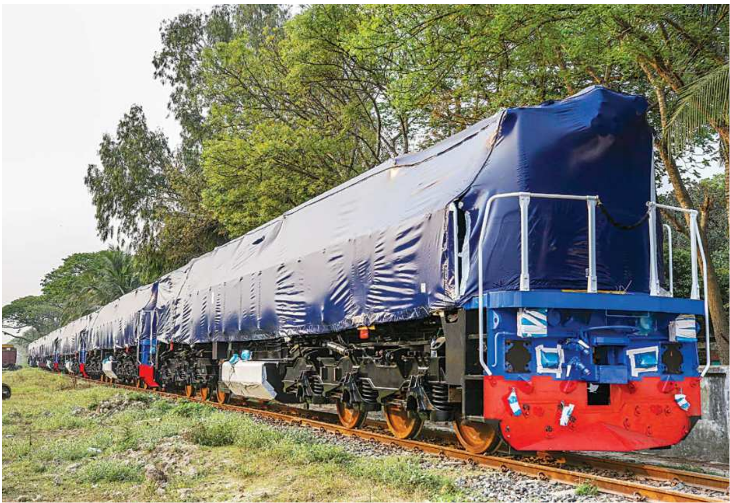
Eight of the 40 fast broad-gauge locomotives that Bangladesh Railway (BR) purchased from a company of the United States arrives in Chattogram. The locomotives have been given temporary metre-gauge undercarriages so that they could be taken to Dhaka's Tongi Railway Station. From there, they will be sent to Parbatipur locomotive factory.