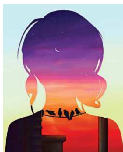
Artworks from the exhibition.

Artist Mashiat Lamisa Kangkhita's "Possibilities" is a digital illustration that reflects on the various forms of restraint experienced by women.