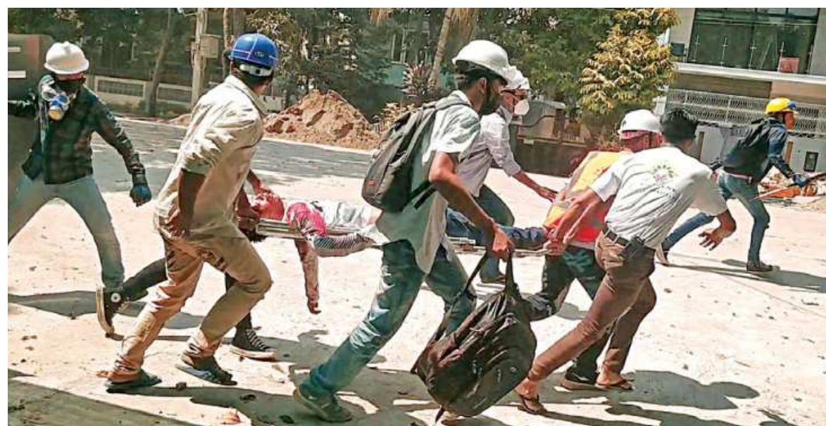
Fellow protesters carry an injured comrade on a stretcher during an anti-coup protest in North Dagon, Yangon, yesterday. Story on page 12.

Hasina also urged people to get vaccinated in a disciplined manner after registration so that no chaos occurs in the Covid-19 vaccination centres as happened in the past.