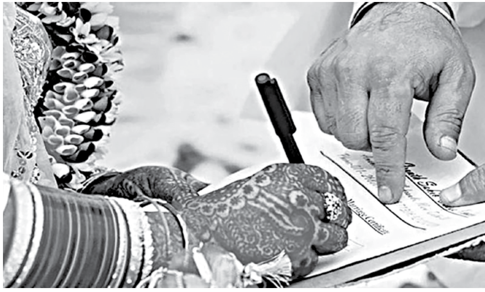
Under Bangladesh's civil law, every marriage must be registered, and the legally married couple must get a marriage certificate.