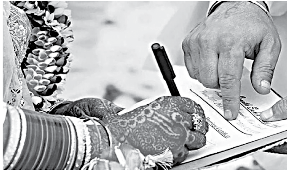
Under Bangladesh's civil law, every marriage must be registered, and the legally married couple must get a marriage certificate.