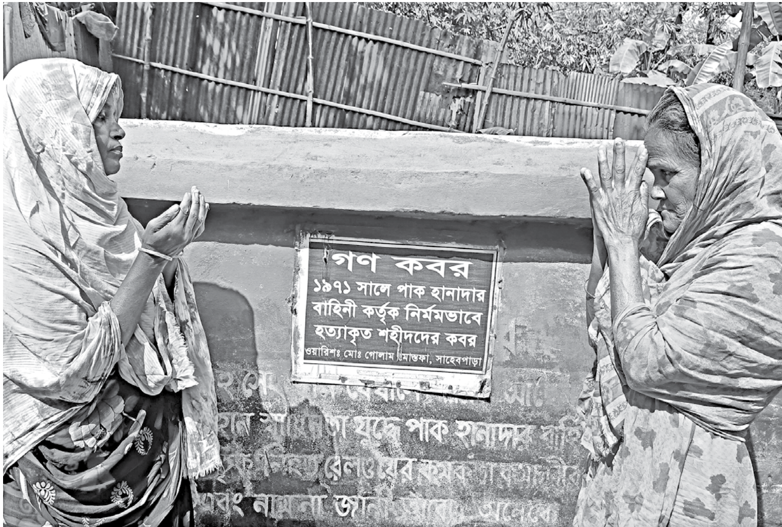
A Muslim and a Hindu woman offer prayers for souls of their martyred relatives at Sahebpara mass grave in Lalmonirhat town.