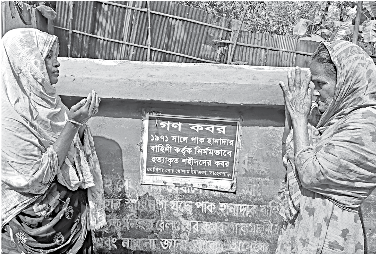
A Muslim and a Hindu woman offer prayers for souls of their martyred relatives at Sahebpara mass grave in Lalmonirhat town.