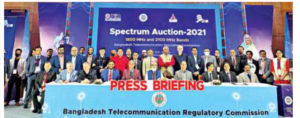
Telecom Minister Mustafa Jabbar and top officials of Grameenphone, Robi, Banglalink and Teletalk attend a media briefing at the end of a spectrum auction at the InterContinental Dhaka hotel yesterday.