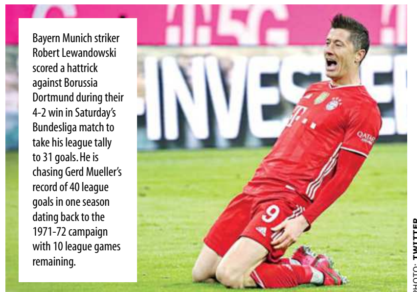
Bayern Munich striker Robert Lewandowski scored a hattrick against Borussia Dortmund during their 4-2 win in Saturday's Bundesliga match to take his league tally to 31 goals. He is chasing Gerd Mueller's record of 40 league goals in one season dating back to the 1971-72 campaign with 10 league games remaining.

In a flawless start, Dortmund, who had won the last four games in all competitions, were 2-0 up by the ninth minute with Haaland thundering in a shot and tapping in a cutback to take his league tally to 19 goals. Bayern, however, quickly worked their way back, took control and struck twice with Lewandowski in the 26th minute and a 44th minute penalty.