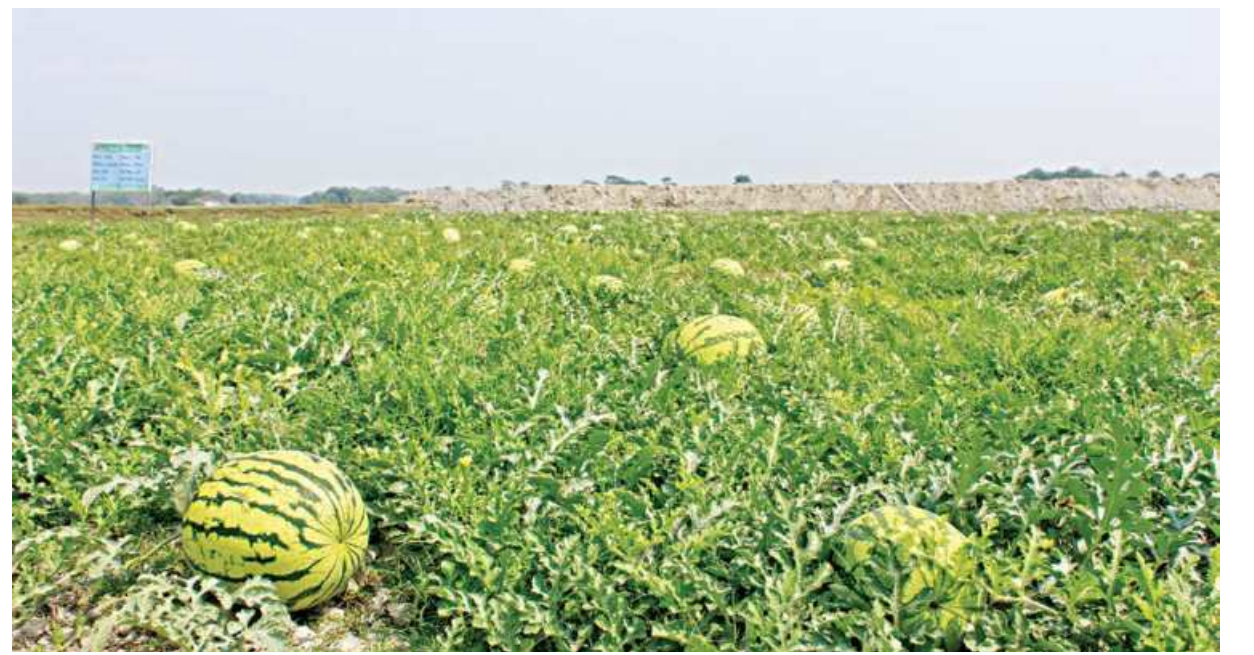
A field dotted with early variety watermelon on the shores of Bay of Bengal, in Jahajamara village of Patuakhali's Rangabali upazila.

The earnings from its sale have been estimated at Tk 30 crore, he added.