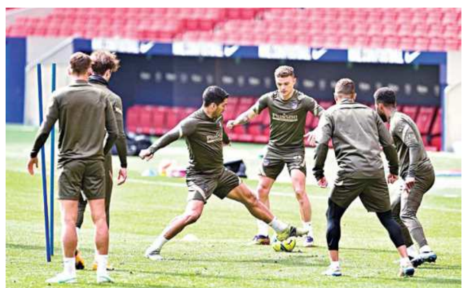
Atletico Madrid striker Luis Suarez vies for the ball with his teammates during a practice session ahead of tonight's La Liga encounter against Real Madrid.

Atletico haven't tasted a single win in their last 9 La Liga clashes against Real.