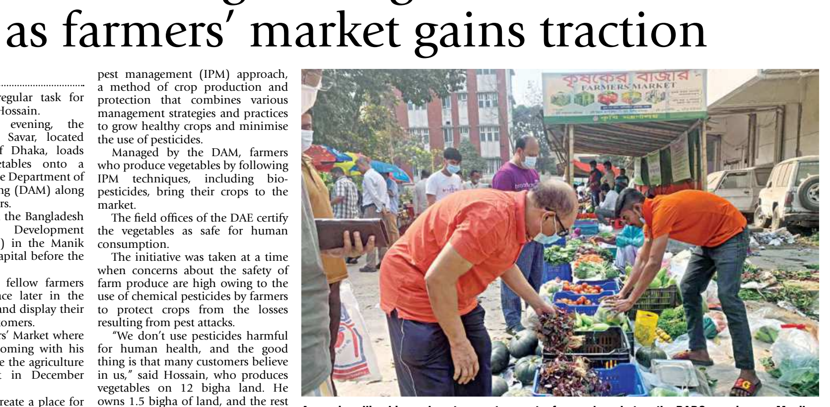
A man is selling his produce to a customer at a farmers' market on the BADC premises on Manik Mia Avenue in Dhaka on Friday.