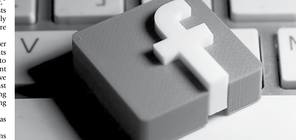
allowing Facebook operations program manager

Industrial orders are closely watched as a key indicator of future economic activity, especially in manufacturing powerhouse Germany. The month-on-month January increase was driven by a 4.2 per cent jump in new orders from abroad, particularly outside the eurozone, Destatis said.