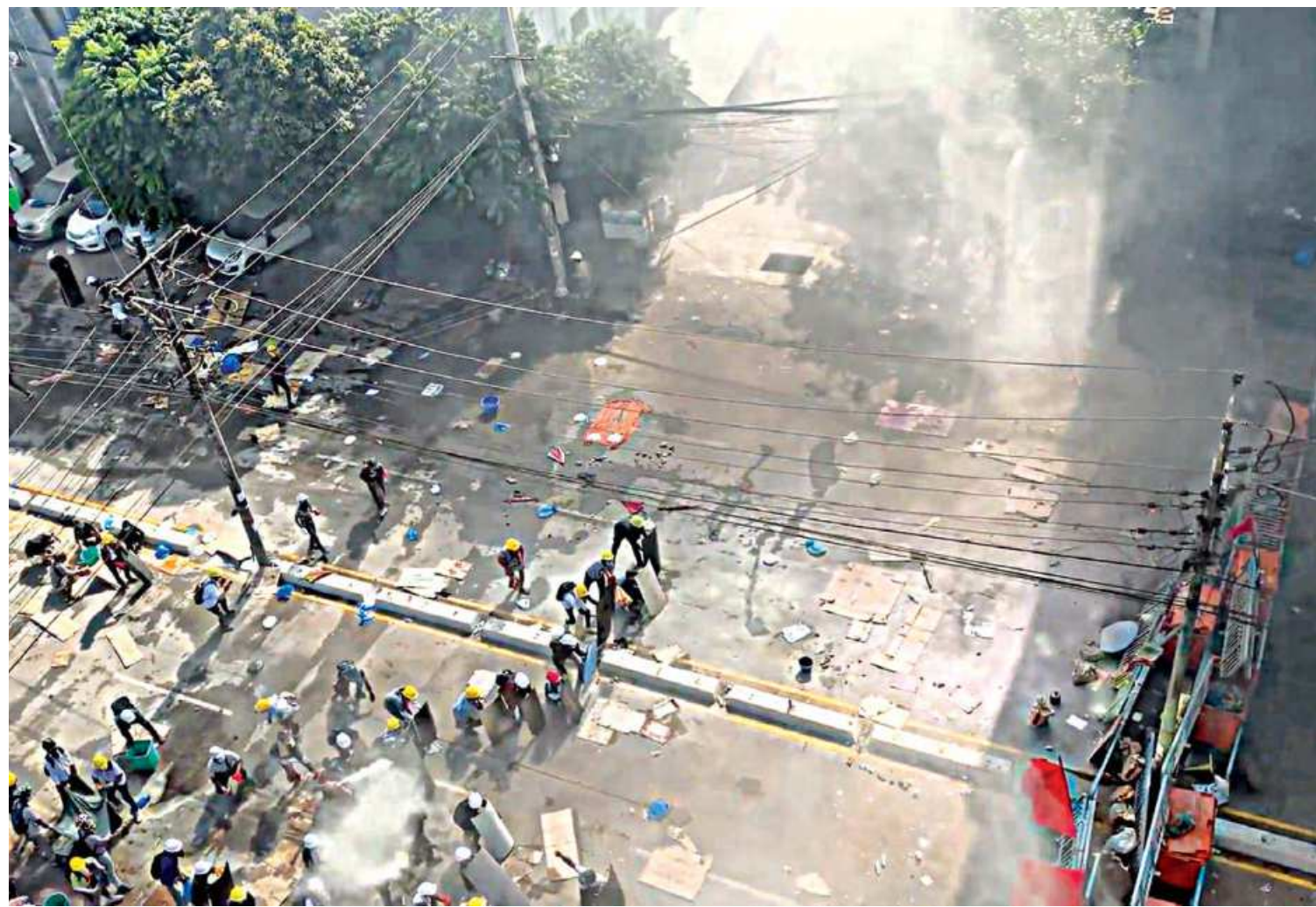
In this still image taken from a video obtained by yesterday, demonstrators are seen behind makeshift barricades during a protest in Yangon, Myanmar, on Thursday. Myanmar has been in turmoil since the February 1 coup that ousted civilian leader Aung San Suu Kyi from power, with soldiers and police escalating the use of force on the streets to quell nationwide protests.