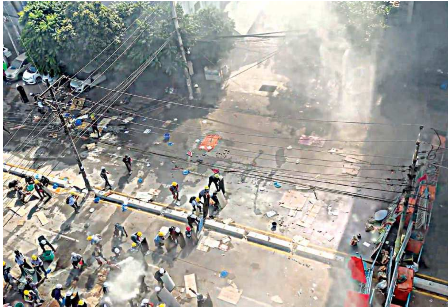
In this still image taken from a video obtained by Reuters yesterday, demonstrators are seen behind makeshift barricades during a protest in Yangon, Myanmar, on Thursday. Myanmar has been in turmoil since the February 1 coup that ousted civilian leader Aung San Suu Kyi from power, with soldiers and police escalating the use of force on the streets to quell nationwide protests.