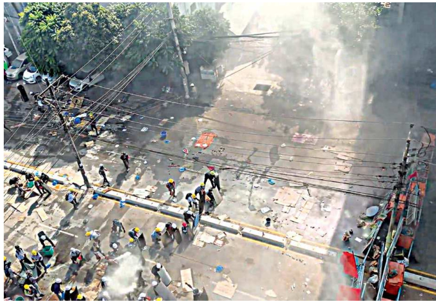
In this still image taken from a video obtained by Reuters yesterday, demonstrators are seen behind makeshift barricades during a protest in Yangon, Myanmar, on Thursday. Myanmar has been in turmoil since the February 1 coup that ousted civilian leader Aung San Suu Kyi from power, with soldiers and police escalating the use of force on the streets to quell nationwide protests.