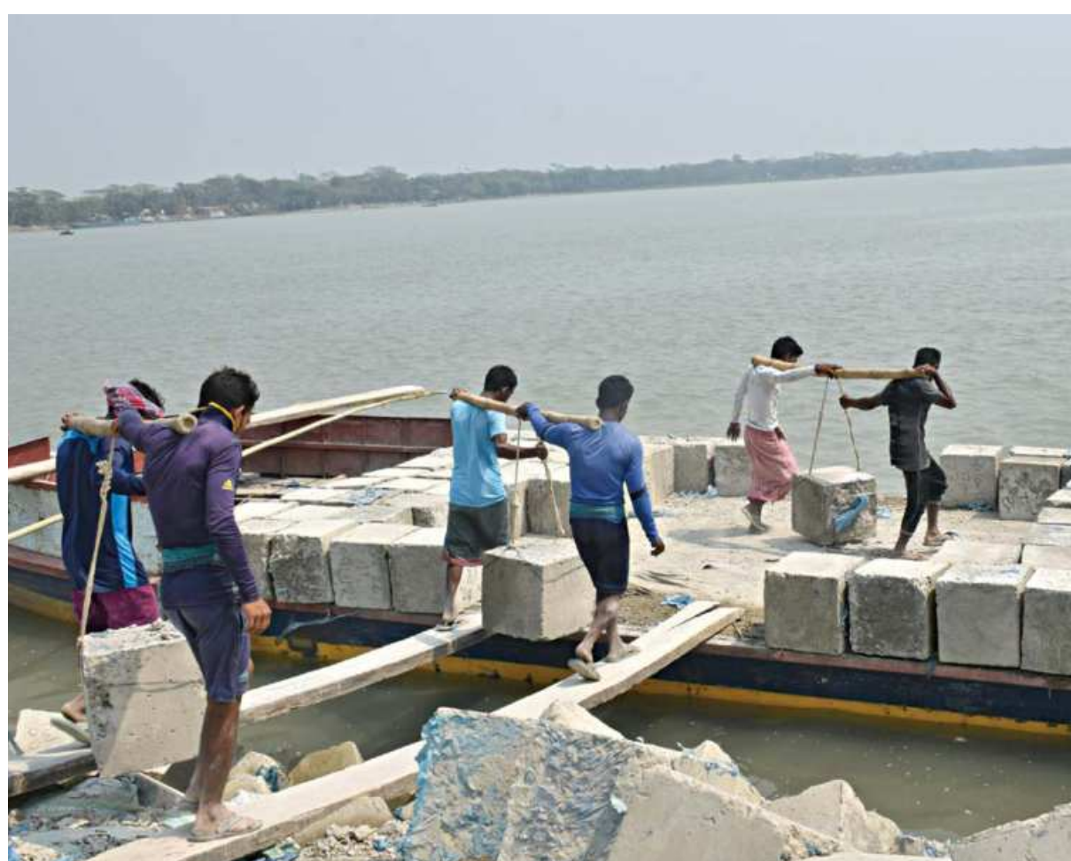
Workers loading cement blocks onto a trawler on the Kirtonkhola river at Barishal Sadar upazila's Charbaria area yesterday. As part of an initiative of the Water Development Board, such cement blocks are placed on the banks of the river to prevent erosion.