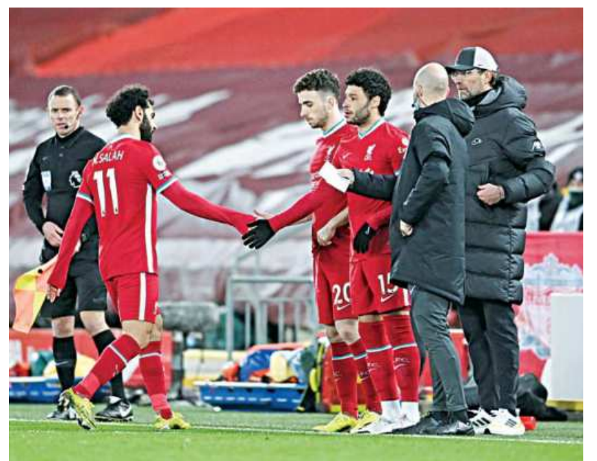
Liverpool's star striker Mohamed Salah was visibly unhappy at being substituted during their 1-0 defeat against Chelsea at Anfield on Thursday night.

"We have to show our quality in these moment and we don't do that often enough. It is a massive blow. It is not done yet. We have to win football games."