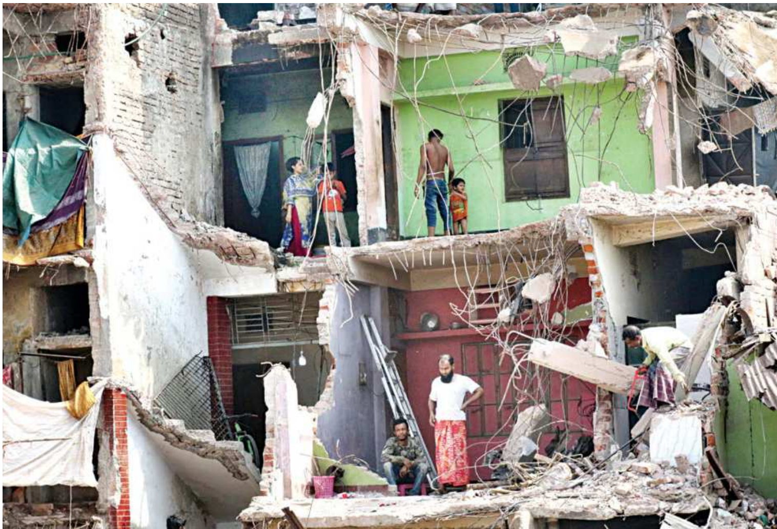
People live in an unsafe three-storey building along the Buriganga in the capital's Lalbagh area. Many buildings in the area were knocked down partially during eviction drives by the Bangladesh Inland Water Transport Authority in the last few months. But those are still occupied by residents. The photo was taken on Wednesday.