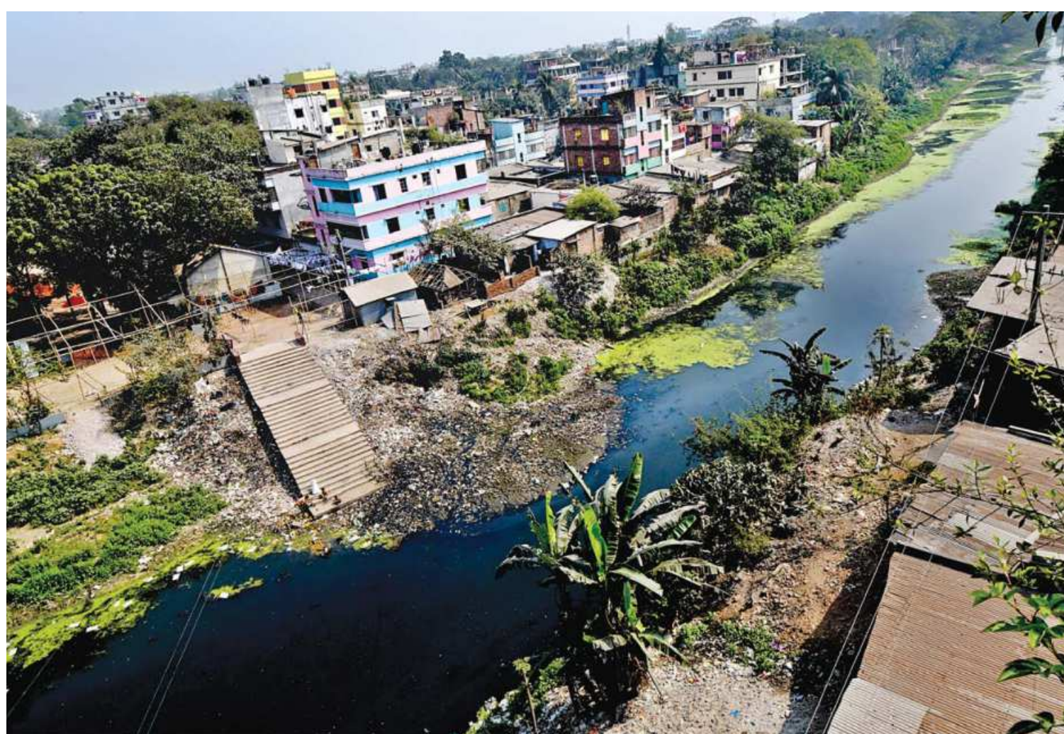
The Korotoa river in Bogura town is in a very bad state due to unabated pollution and grabbing of land. Sewage and liquid waste from households and factories is discharged into the water body, causing the pollution. The photo was taken in the town's Chalopara bridge area recently.