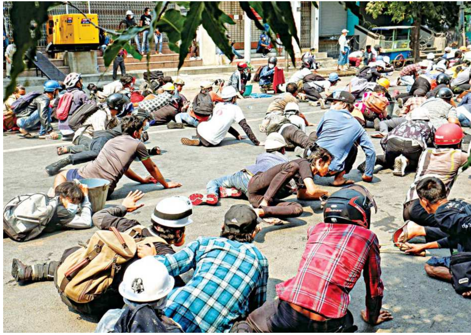
Protesters lie on the ground after police open fire in Myanmar's Mandalay yesterday. Myanmar has been facing chaos since February 1, when the military seized power in a coup and detained much of the country's civilian leadership, including leader Aung San Suu Kyi.