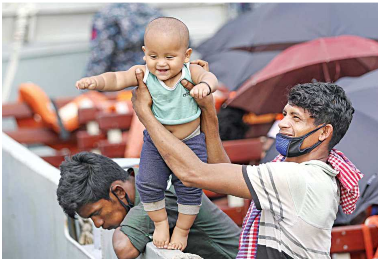
A father gleefully holding his son on a railing, showing him his new home, while disembarking one of the six ships carrying the fifth batch of Rohingyas from the Cox's Bazaar camps to Bhashan Char. Around 2,260 Rohingyas arrived on the island around 3:30pm yesterday. Another 2,200 or so are expected to arrive this afternoon.