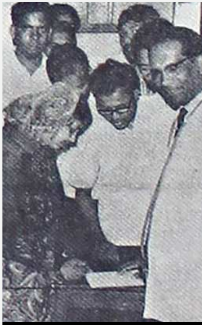
People lining up to donate blood for the injured of the non-cooperation movement in Dhaka on March 4, 1971.