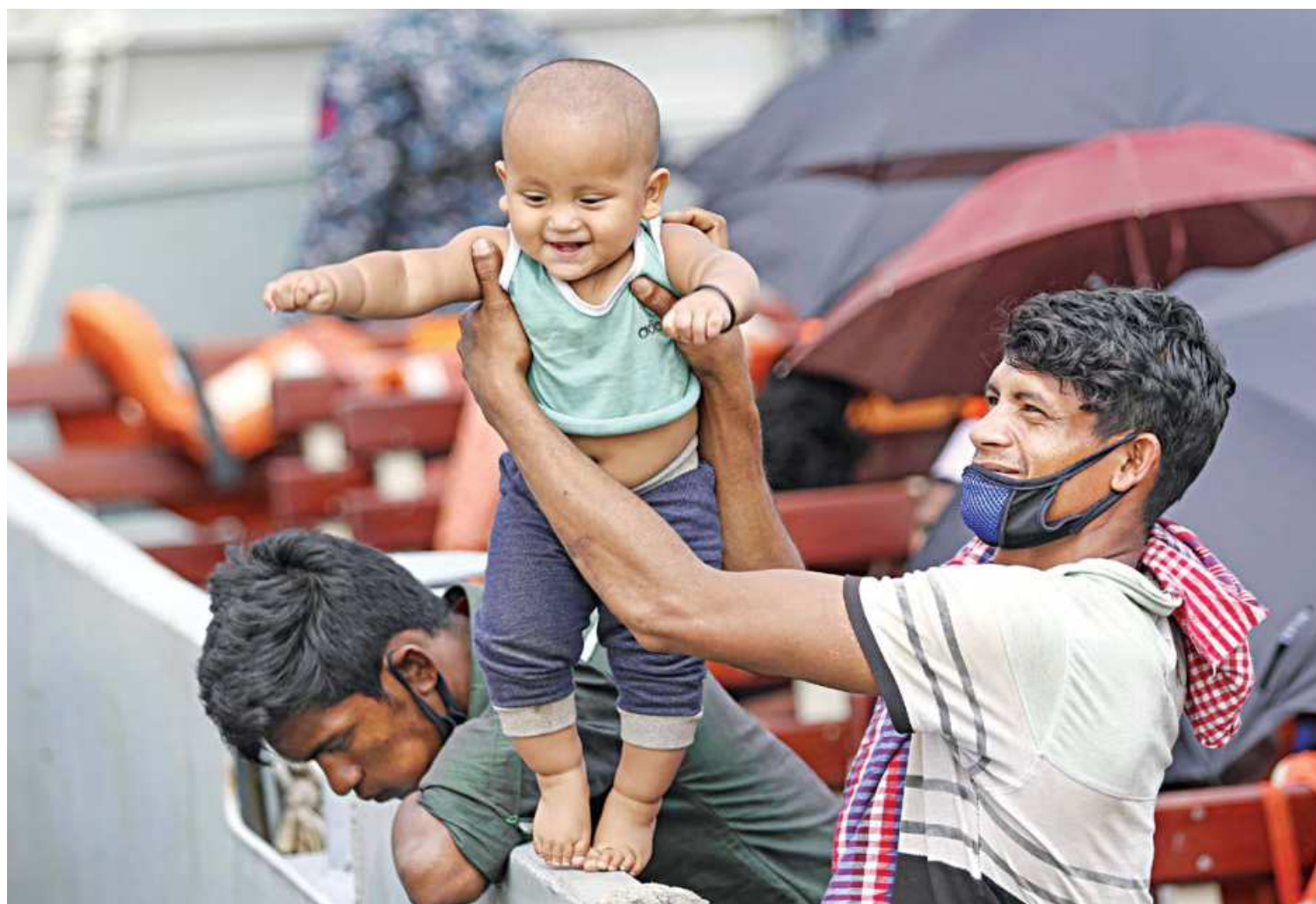
A father gleefully holding his son on a railing, showing him his new home, while disembarking one of the six ships carrying the fifth batch of Rohingyas from the Cox's Bazaar camps to Bhashan Char. Around 2,260 Rohingyas arrived on the island around 3:30pm yesterday. Another 2,200 or so are expected to arrive this afternoon.