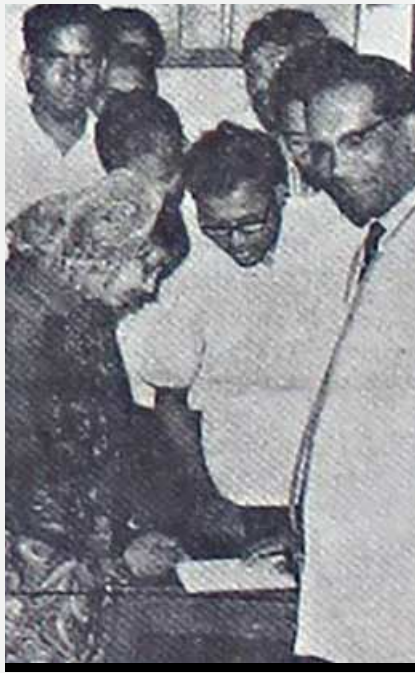
People lining up to donate blood for the injured of the non-cooperation movement in Dhaka on March 4, 1971.