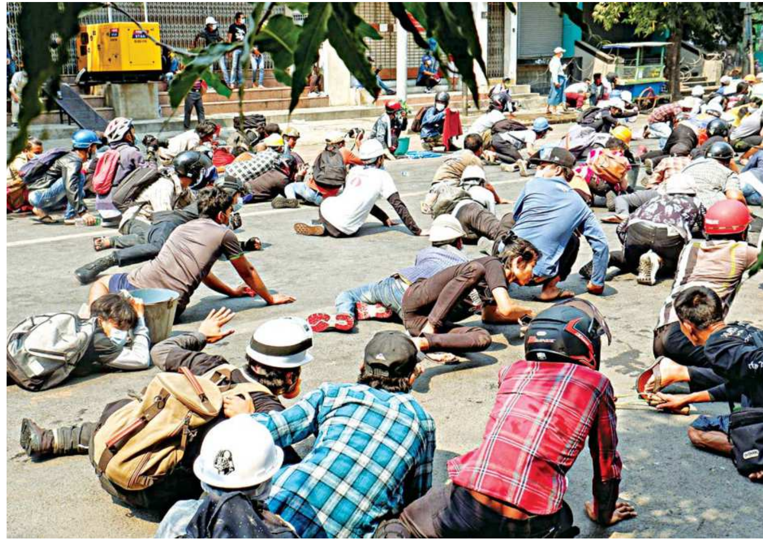
Protesters lie on the ground after police open fire in Myanmar's Mandalay yesterday. Myanmar has been facing chaos since February 1, when the military seized power in a coup and detained much of the country's civilian leadership, including leader Aung San Suu Kyi.