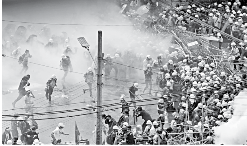
Tear gas and fire extinguisher gas float around demonstrators during a protest against the military coup in Yangon, Myanmar, on March 2, 2021.

The ethnic cleansing of the minority took place under the very nose of a regime that was elected by the people. The government was led by Aung Sung Suu Kyi, a leader who refused to utter the word "Rohingya", even in her 30-minute speech during the hearing of a case against the military's actions at the International Court of Justice (ICJ). An Al Jazeera report detailed, "she failed to use one word in the 3,379-word speech to describe the minority, an ethnic group that has been persecuted for years in Myanmar and denied citizenship rights—Rohingya... She only used the word Rohingya when referring to ARSA [Arakan Rohingya Salvation Army]."