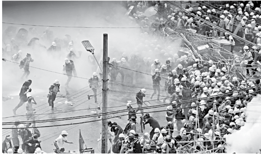
Tear gas and fire extinguisher gas float around demonstrators during a protest against the military coup in Yangon, Myanmar, on March 2, 2021.

The ethnic cleansing of the minority took place under the very nose of a regime that was elected by the people. The government was led by Aung Sung Suu Kyi, a leader who refused to utter the word "Rohingya", even in her 30-minute speech during the hearing of a case against the military's actions at the International Court of Justice (ICJ). An Al Jazeera report detailed, "she failed to use one word in the 3,379-word speech to describe the minority, an ethnic group that has been persecuted for years in Myanmar and denied citizenship rights—Rohingya... She only used the word Rohingya when referring to ARSA [Arakan Rohingya Salvation Army]."