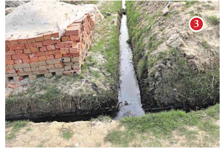
1. Earth removed from a section of the embankment along the Katcha river in Char Kholpatua village of Pirojpur's Indurkani upazila. 2. A flattened part of the same embankment. 3. Liquid waste being released in a network of drainage that runs through surrounding crop fields.