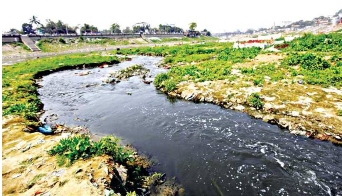
Heavily polluted water being dumped into the Surma river in Kalighat area of Sylhet city. The mindless dumping continues even after throwaway goods formed a plastic berg in the area, significantly reducing the water flow downstream. The photo was taken yesterday.

The veteran politician said it is quite necessary to amend the DSA's "repressive" clauses in line with recommendations made by the civil society members.