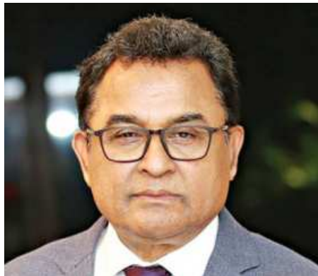
AHM Mustafa Kamal

The graduation would increase foreign investment in Bangladesh, he said, adding that the economy will gradually become stronger. On February 26, the United Nations Committee for Development Policy recommended Bangladesh's graduation after the second triennial review of the LDC category.