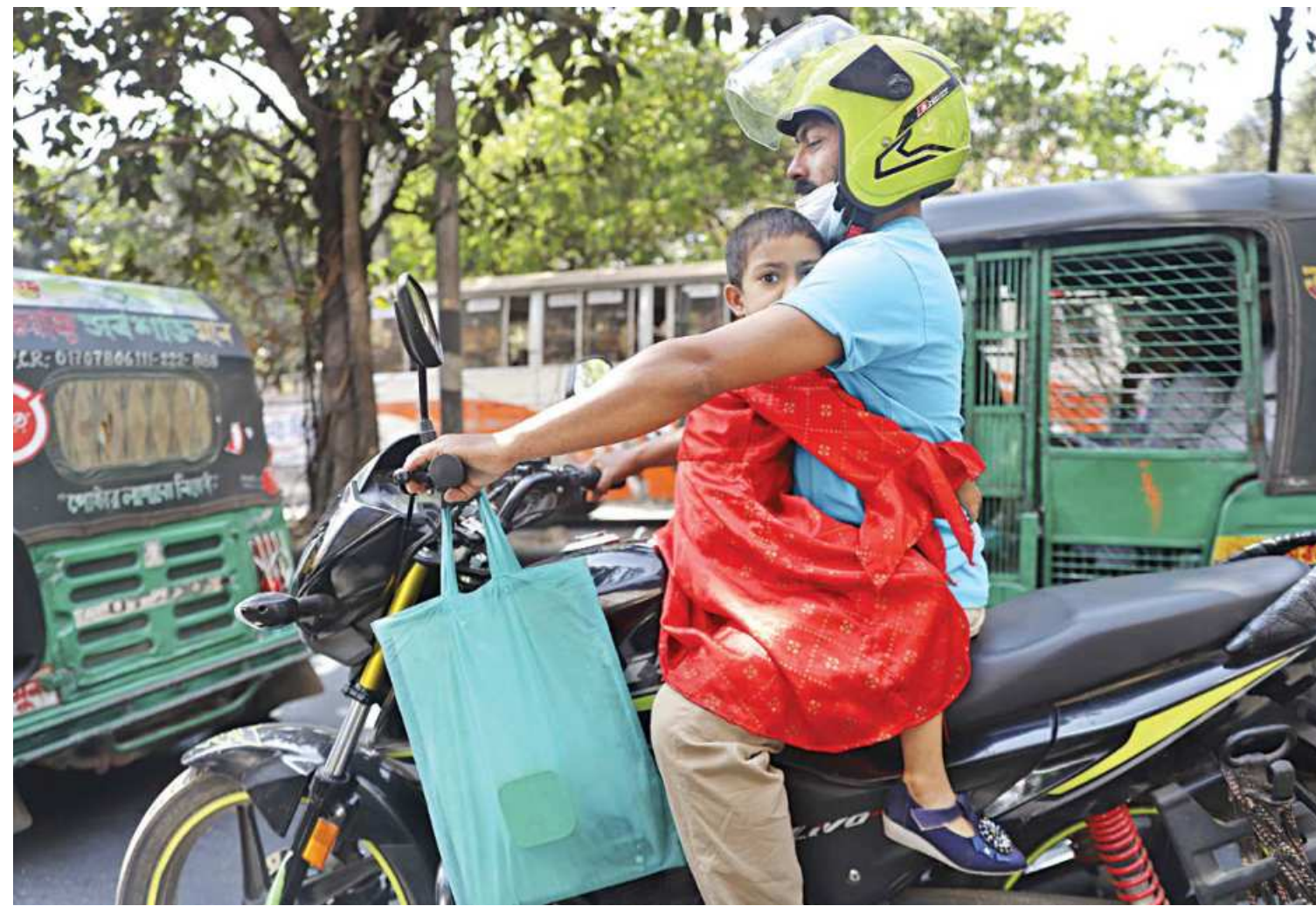
A child, apparently afraid of looking ahead from a motorcycle at speed, is made to sit hugging her father. The child is not wearing a mask or a helmet. The photo was taken in the capital's Sabujbagh area yesterday.