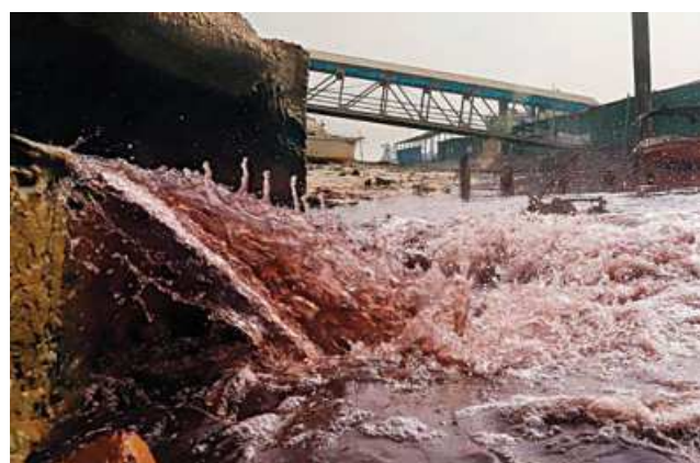
The waste of multiple dyeing factories contaminating the water of the Buriganga river in the capital's Shyampur area. Garbage, top photo, is also dumped on the bank of the river considered the lifeline of the capital. The photo was taken recently.