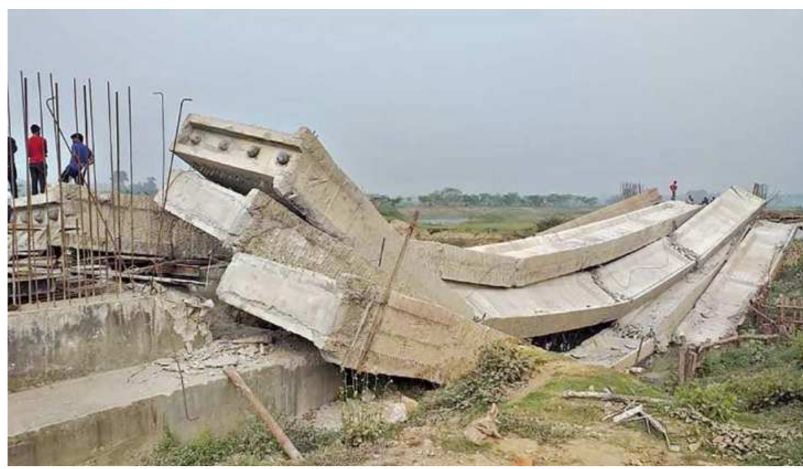
Five girders of an under construction bridge on Pagla-Jagannathpur-Raniganj-Aushkandi regional highway in Sunamganj's Jagannathpur upazila collapsed Sunday night. Officials of the construction company, MM Builders and Engineers Ltd, claimed that the accident happened when a hydraulic jack broke during the installation of a girder on a pier. The Road Transport and Highways Division has formed a four-member committee to investigate the incident.

BNP leader Tabith Awal said he was stopped in Puthia upazila at 1:00pm on his way to the rally.