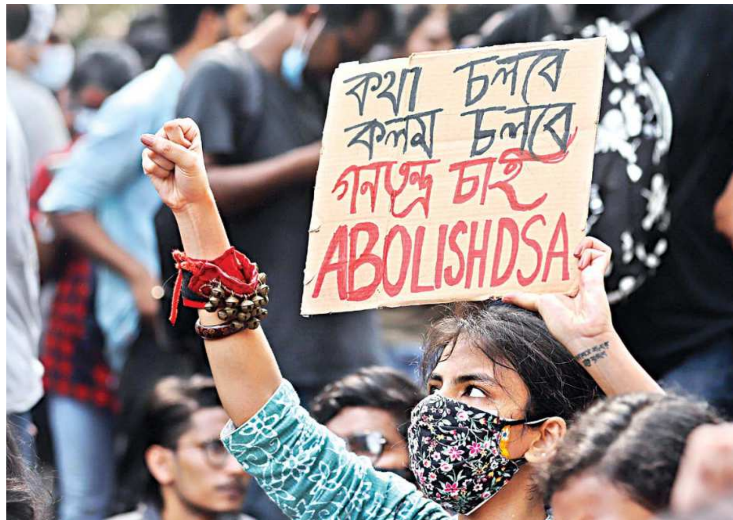
The progressive students' alliance at a rally on the capital's Abdul Gani road, after holding one in front of the home ministry, to protest the death of writer Mushtaque Ahmed, who was in jail under the Digital Security Act.