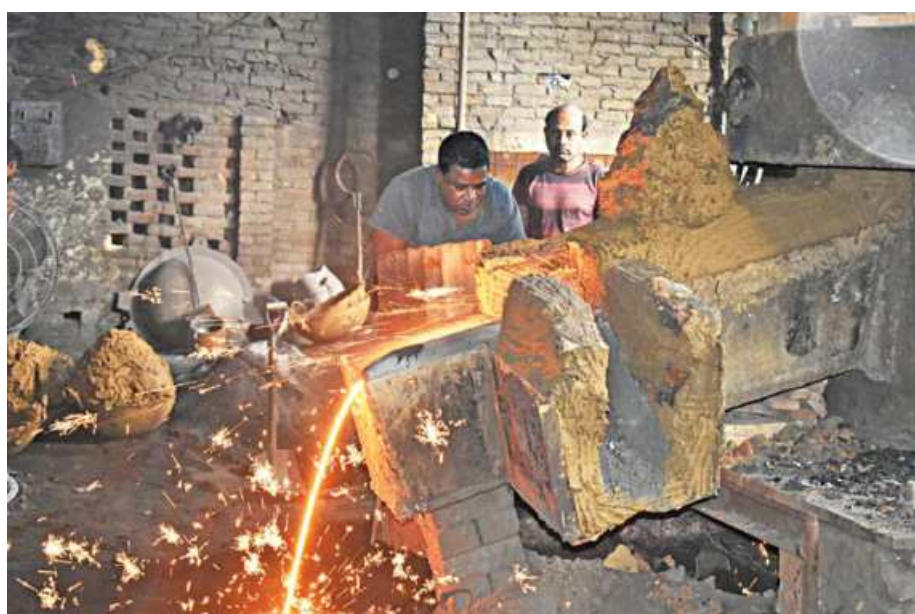
In a bid to encourage industrialisation, the government will frame a policy to award green industrialists.