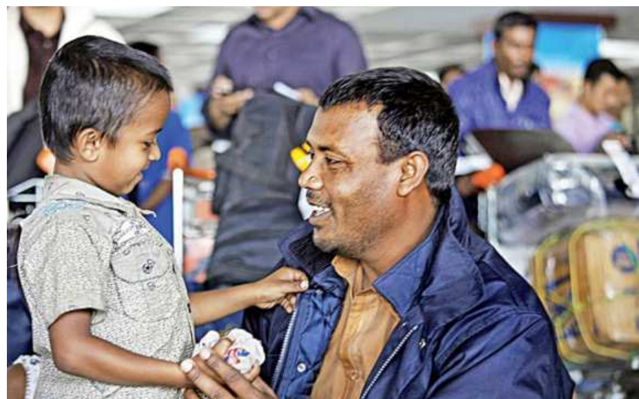
World Bank studies show that remittances alleviate poverty in lower- and middle-income countries.