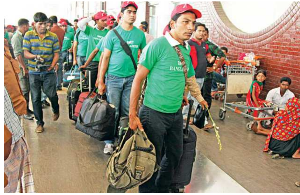
A view of migrant workers entering the Shahjalal International Airport

Currently, overseas employment is limited to about 20 countries. The market expanded from