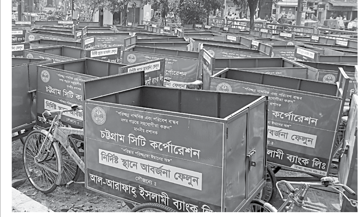
These vans were bought by Chattogram City Corporation, with the help of a private organisation, to help speed up waste collection around the city. This photo was taken yesterday from in front of the old City Corporation office in

admirers are requested to pray for the salvation of the departed soul.