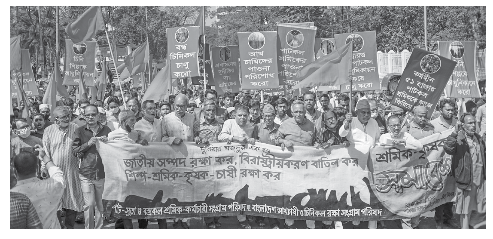
Jute-Yarn and Textile Workers Employees Sangram Parishad and Bangladesh Sugarcane Farmers and Sugar Mill Protection Sangram Parishad organised a rally and procession at the capital's Central Shaheed Minar yesterday, to press home a number of demands centring issues of the workers and farmers.

Police recovered the body and sent it to RMCH for autopsy yesterday afternoon,