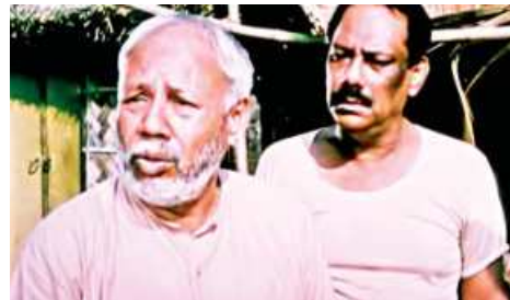
Hajar Bochor Dhore

with a singer named Golapi (Babita). The actor's portrayal of Mondol earned him appreciation at both home and abroad, including the Moscow International Film Festival.