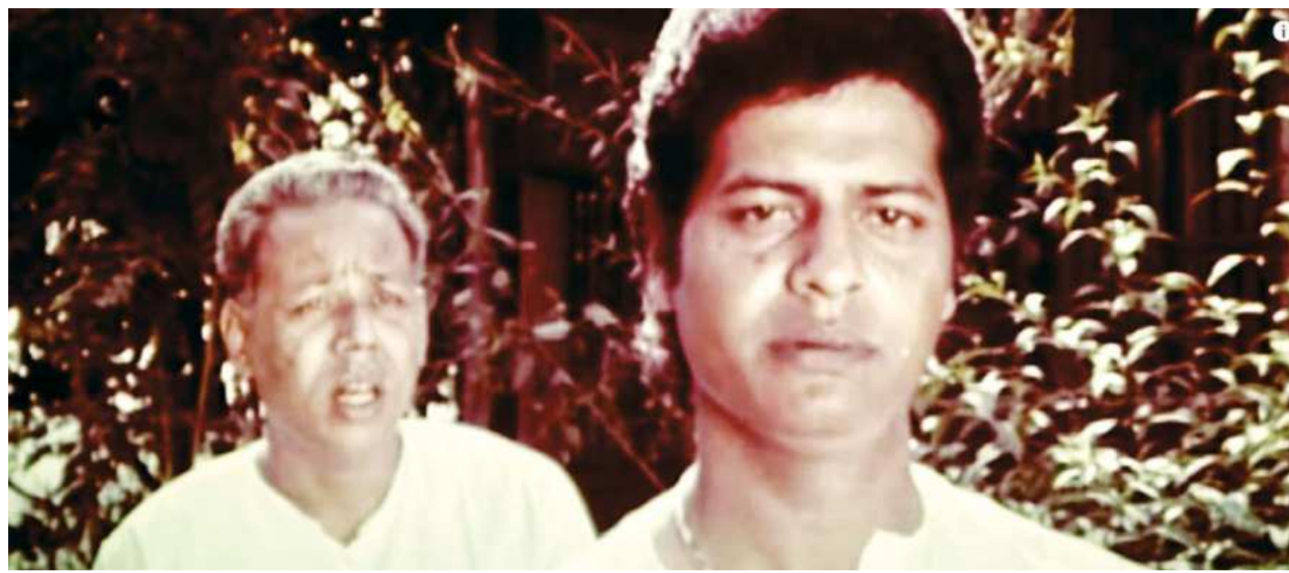
Golapi Ekhon Train E

In Amjad Hossain's "Golapi Ekhon Train E" A T M Shamsuzzaman played the role of Mondol, an influential person in his village, whose son Milon (Farooque), falls in love