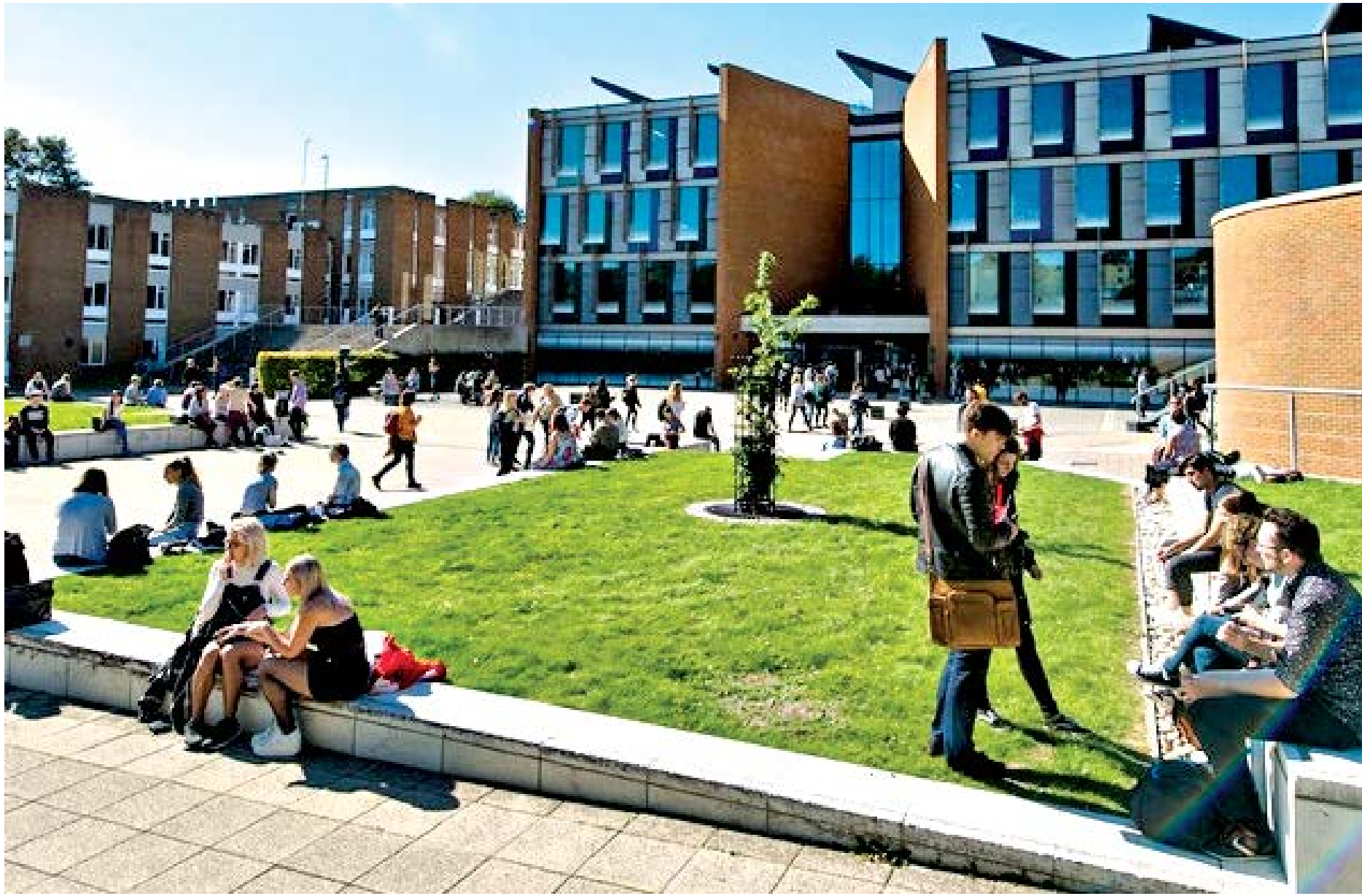
The University of Sussex is surrounded by a national park and is located within the south coast city of Brighton and Hove.