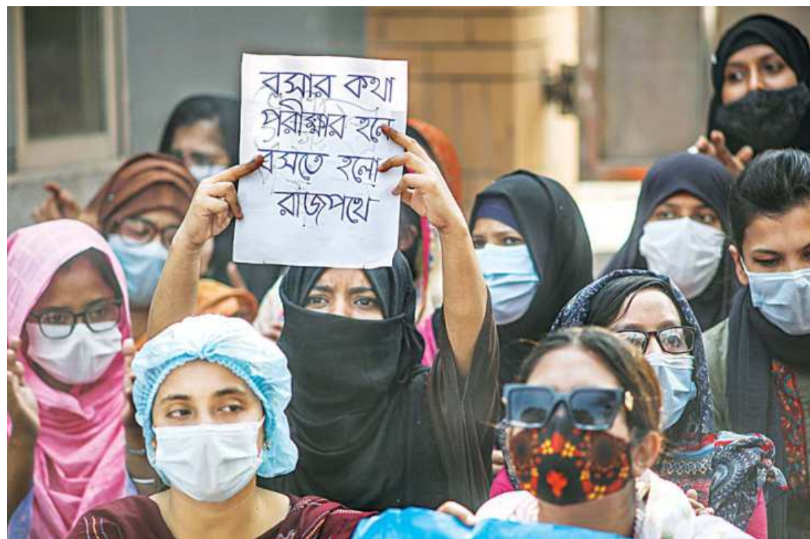
Students of the College of Home Economics demonstrate near the institute's gate yesterday, protesting the authorities' decision of not taking pre-announced examinations.