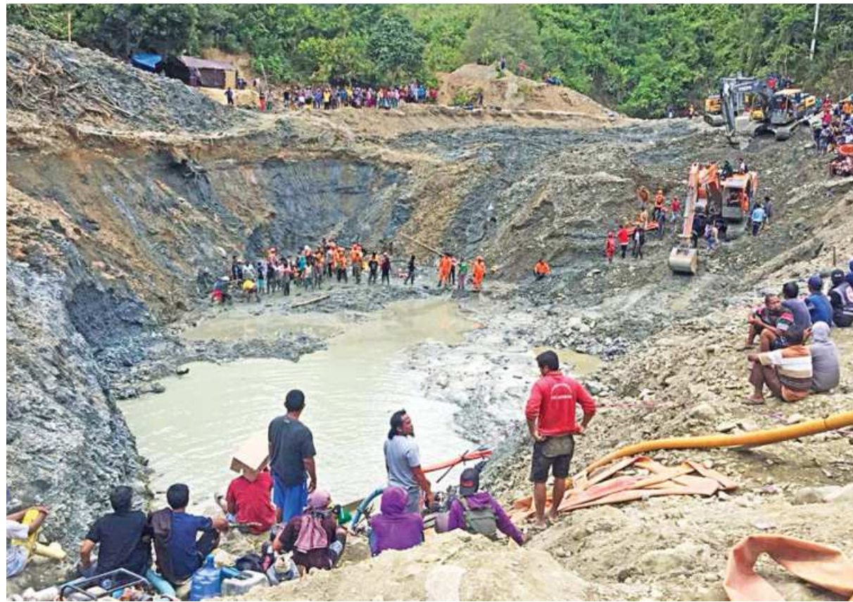
Rescue teams conduct a search for miners buried by a landslide at an illegal gold mining operation in the village of Buranga in Parigi Moutong Regency, Central Sulawesi, Indonesia, yesterday. Five women and one man killed in the landslide while some 16 survivors were pulled from the debris.