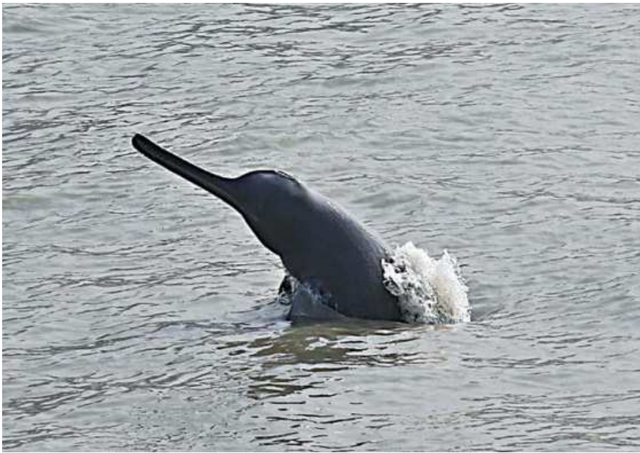
A long-snouted dolphin spotted in the Karnaphuli river near Chattogram city's Ichhanagar. Unlike fish with gills, this mammal needs to come to the surface for oxygen. Such dolphin sightings have now become rare and experts blame river pollution and increased traffic on waterbodies for this. The photo was taken recently.