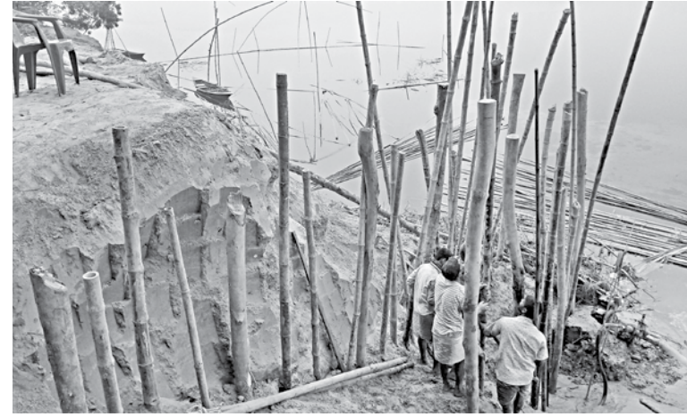
Villagers in Roumari upazila of Kurigram building structures on the bank of the Halhaliya river to protect themselves from erosion.

If the ten structures on the river bank are completed, erosion of Halhaliya can be prevented on a temporary basis, he said.