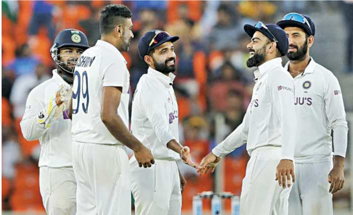
India captain Virat Kohli was all smiles as the English batsmen fell like ninepins in their second innings during the second day of the third Test in Ahmedabad yesterday. (Below) Spinner Axar Patel celebrates one of his five wickets on the day.

Left-arm spinner Patel is the first bowler to take successive 5-wicket hauls in a day-night Test.