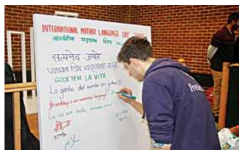
International Mother Language Day at The University of Sussex.

ences and Sciences. The University of Sussex's Business School is EQUIS and AMBA accredited, and is ranked among the UK's top business schools. The institution is also world famous for Development Studies and has been ranked by QS as the world's top university for the subject for the past four years. In recognition of Bangladeshi students' contribution to the university, Sussex recently introduced a master's scholarship for students from Bangladesh. The Sussex Bangladesh Scholarship is worth £3000, and is available to applicants for a wide number of courses. Sussex warmly welcomes Bangladeshi students in both undergraduate and postgraduate programmes. Applying to Sussex is simple and can be done through the university's dedicated application portal. The university's Bangladesh Students' Society actively contributes to the diversity and culture of the institution. Since its formation, the society has been successfully organising