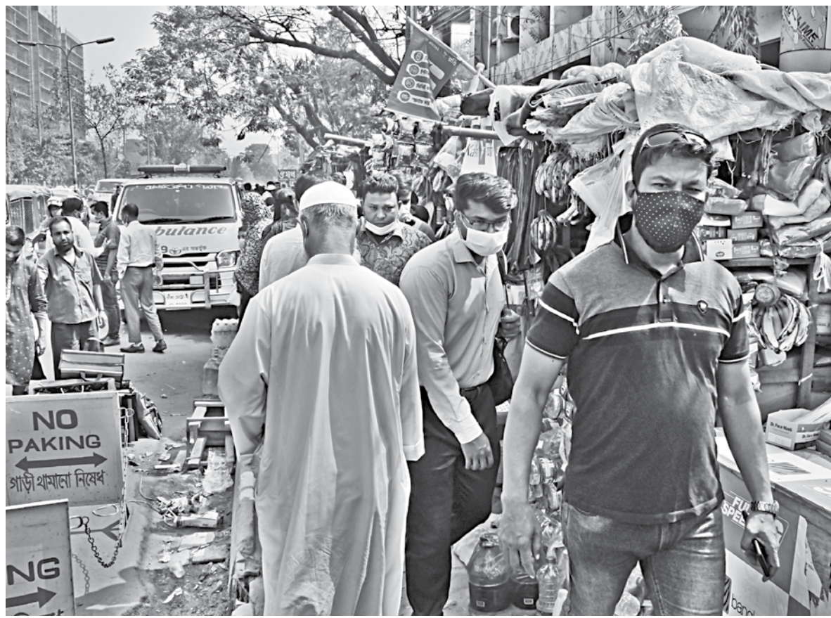
The footpath in front of Dhaka Shishu Hospital has never been empty of hawkers in recent memory. But the presence of large crowds outside a hospital largely hinders the ease of movement of patients, attendants and hospital staff, who are often faced with emergencies.