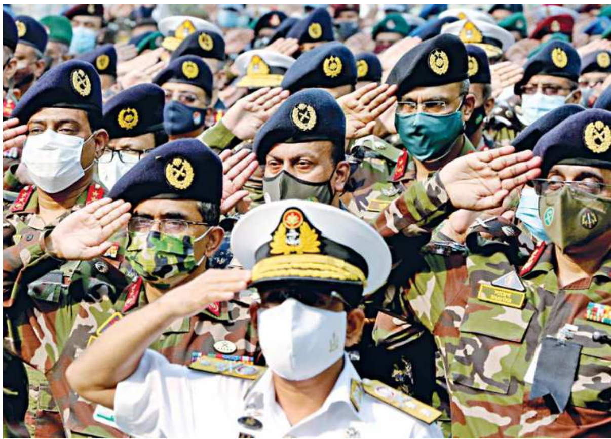
Members of the armed forces pay tribute to the army officials who lost their lives in the Pilkhana carnage. The nation yesterday observed the 12th anniversary of the carnage, where 74 people, including 57 army officers, were killed, after then Bangladesh Rifles staged a revolt. The photo was taken from the capital's Banani Military Graveyard.