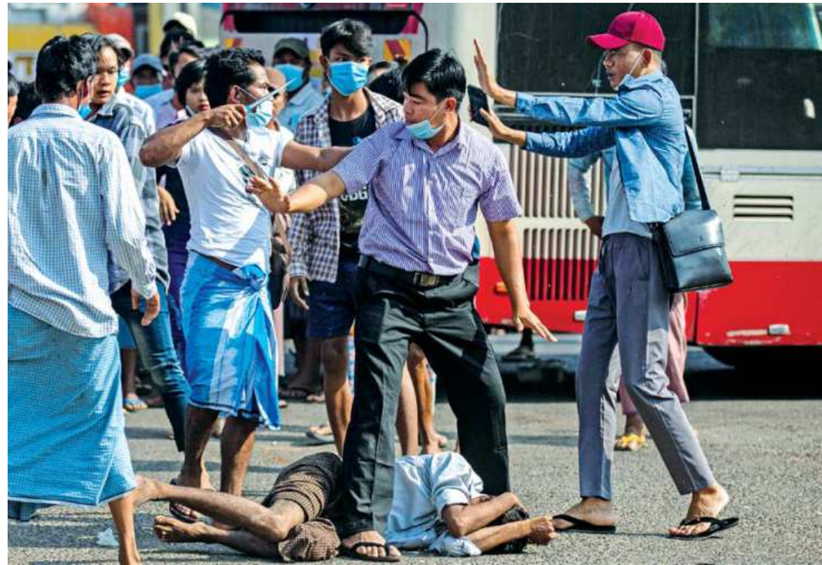
A military supporter points a sharp object as he confronts anti-coup protesters during a military support rally in Yangon, Myanmar, yesterday. A protester is seen injured on the ground.

Pakistan reported 253 ceasefire violations in first two months of 2021 while reported 591 violations by Pakistan.