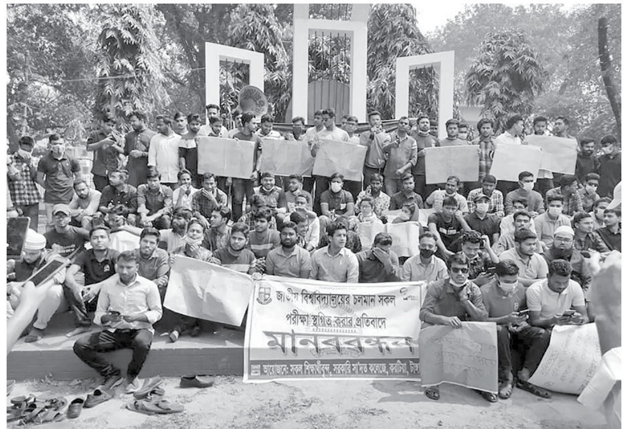
Students of Government Sadaat College in Tangail's Karatia stage a demonstration, followed by a human chain programme, at the institution's Shaheed Miner premises yesterday, protesting suspension of the ongoing examinations of National University.