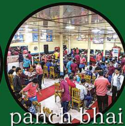
panch bhai restaurant

The breakfast at Panshi has everything. The usual porota-bhaji-thick creamy cup of tea works, but everyone swears by the khichuri. It's... beautiful.