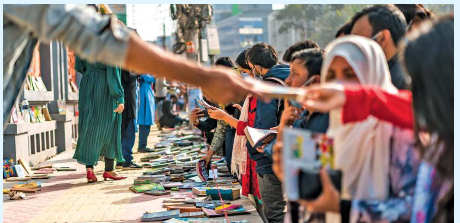
Book Road Khulna held on February 1, 2021 was the first community-wide book exchange of its kind in Bangladesh. Dhaka will host its own version on February 26, 2021 in Rabindra Sarobar.