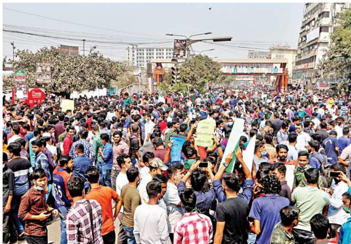
Students of seven colleges affiliated to Dhaka University stage demonstrations blocking the Nilkhet intersection in the capital yesterday, demanding continuation of their ongoing exams and reopening of dormitories. The protest caused traffic tailback on many city streets, bringing sufferings to people.