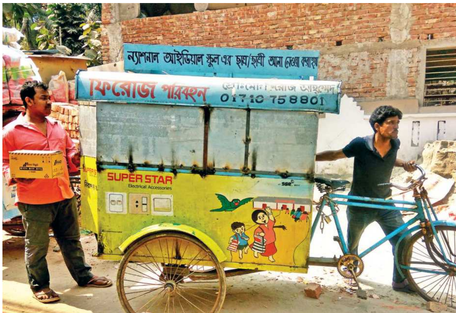
A school van has been transferred into a mobile shop as the van-puller was sitting idle for the last 11 months due to the nationwide closure of all educational institutions over the coronavirus pandemic. The photo was taken in the capital's Moghbazar area.