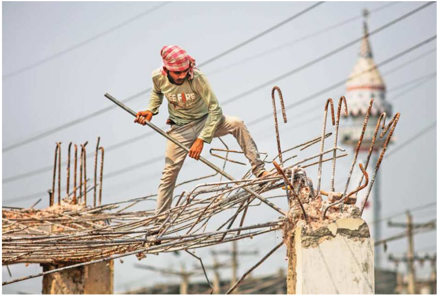
THINKING LITTLE BEFORE DOING ... Without any safety gear, a construction worker demolishing a building in Aminbazar, on the outskirts of the capital, yesterday. He is unaware that he is trying to get the rods he is standing on out. Many such buildings were recently torn down by their owners besides the Dhaka-Aricha highway to make way for a development project.