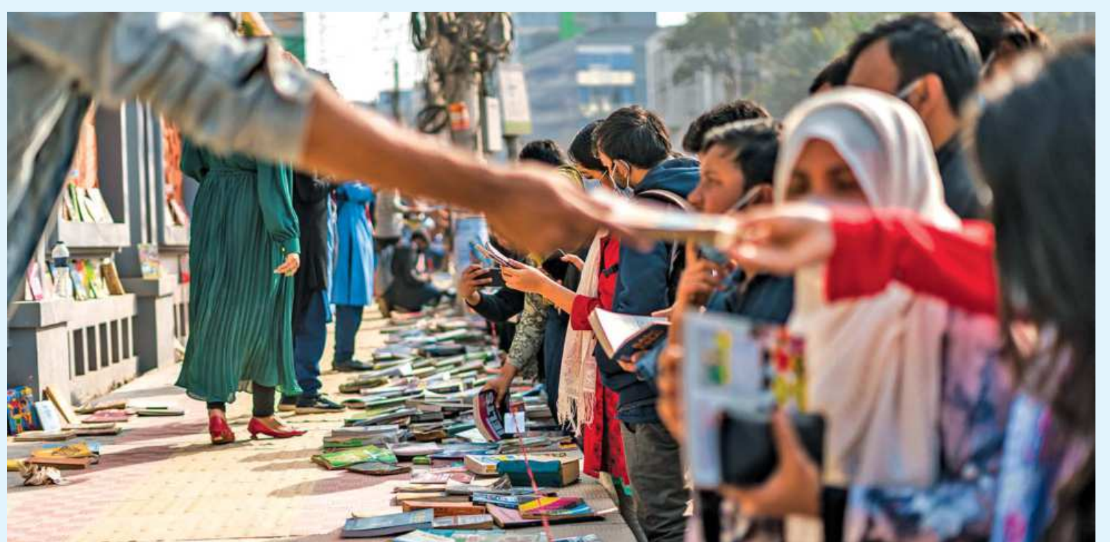
Book Road Khulna held on February 1, 2021 was the first community-wide book exchange of its kind in Bangladesh. Dhaka will host its own version on February 26, 2021 in Rabindra Sarobar.