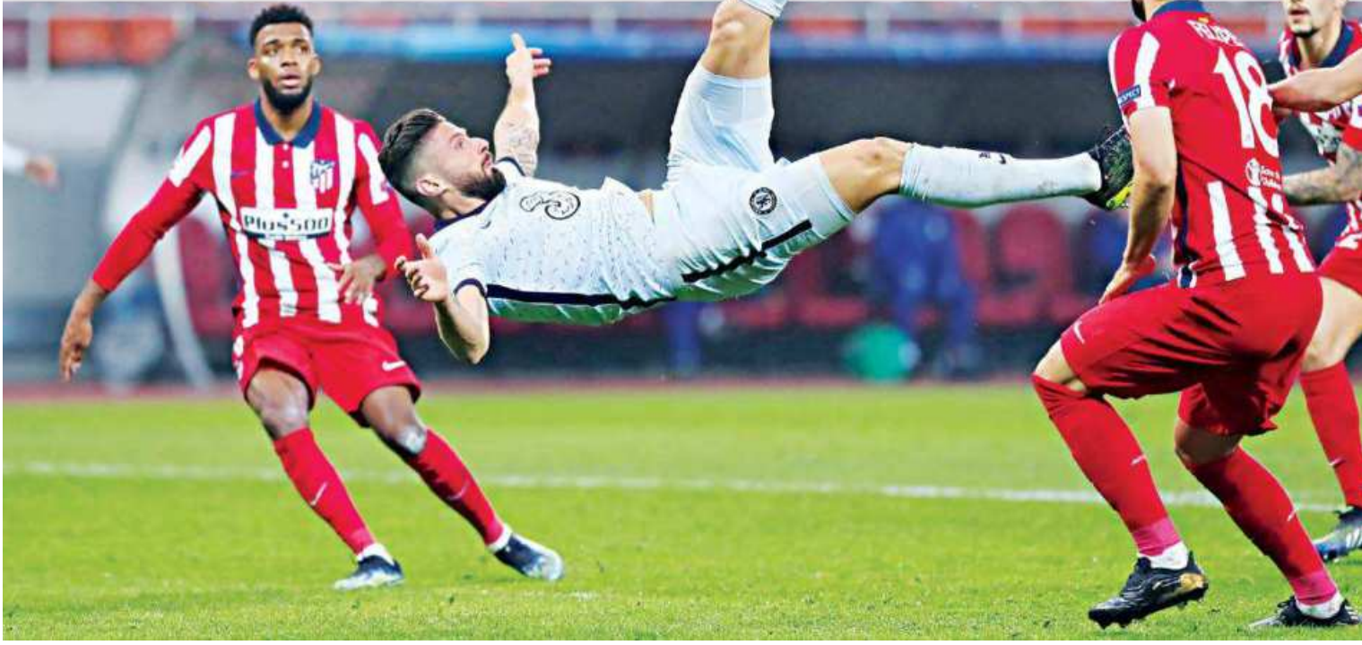
Chelsea striker Olivier Giroud scored a spectacular goal as the Londoners beat Atletico Madrid 1-0 in their Champions League last-16 first leg tie in Bucharest on Tuesday. The Frenchman broke the deadlock in the 68th minute with an outrageous bicycle kick which was flagged offside but eventually given following a VAR review as the ball had come off Atletico's Mario Hermoso before Giroud hit it.

AC Milan vs Crvena Zvezda Live from 2:00 am (Friday) TEN 1 UEFA EUROPE LEAGUE Arsenal vs Benfica Live from 11:55 pm Manchester United vs Real Sociedad Live from 2:00 am (Friday)